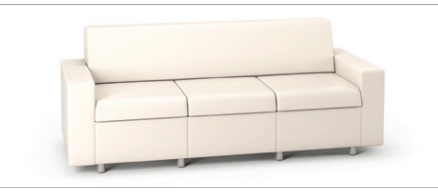
Modular Amelio with Wide Arms

Amelio Modular is an innovative, patent-pending sleep solution that has been designed to allow hospitals to more cost-effectively address a constant reality: the need for change. Patient rooms are not static spaces, and Amelio Modular enables you to adapt them to changing needs. Each component of Amelio is a module, designed to be added or removed as space needs change: seat, table, storage and footrest modules can be added and removed to reconfigure the sleep sofa - to change overall dimensions, or change the functionality of the sofa - or to replace damaged components. No other sleep solution provides this innovative capability, which can substantially extend the useful life of the product, and allow it to continually evolve as your space is adapted to improve patient care. Use the link: Animation video to see a video demonstrating Amelio Modular's unique ability to change and evolve with you.