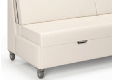
LATEX FREE that latex causes in some people.