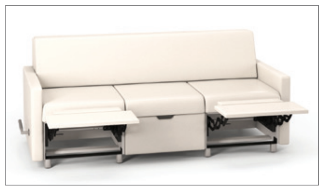
Modular Amelio with Seat Module with Footrest and Center Armless Modular Amelio Storage Module