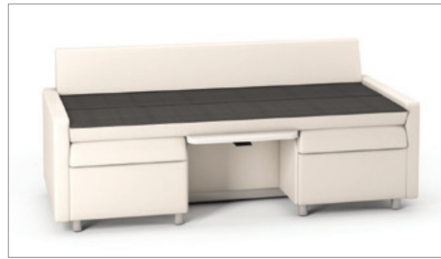
Modular Amelio in Sleep Mode