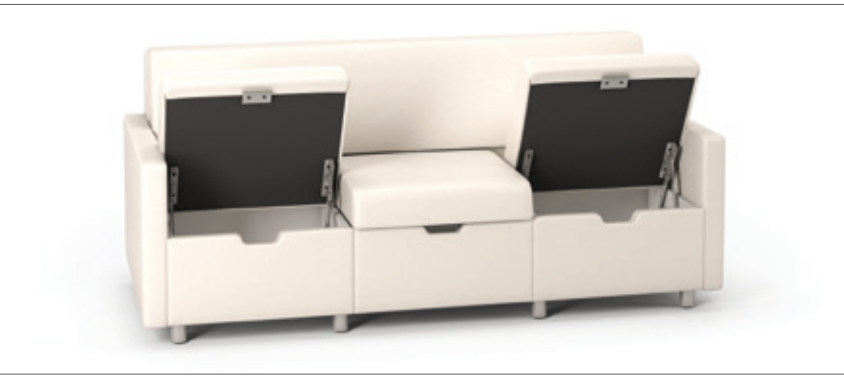
Modular Amelio with Seat Modules with Storage