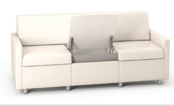
Modular Amelio with Fixed Height Table with Storage