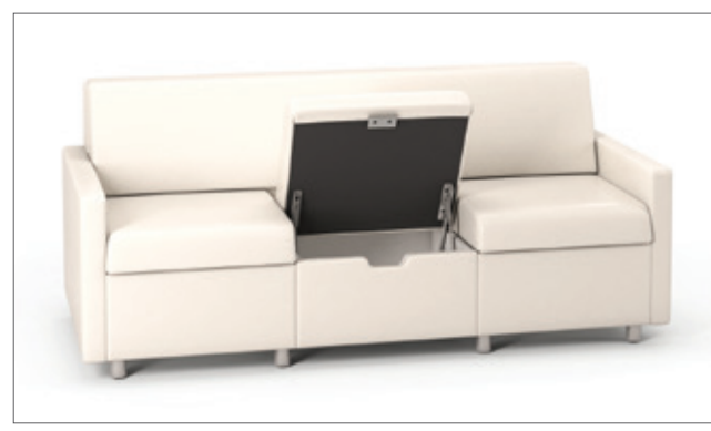
Modular Amelio with Center Seat Module with Storage