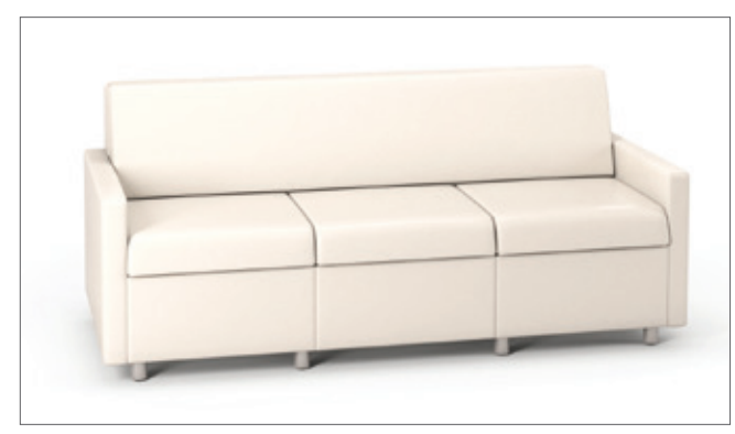
Modular Amelio with Arms