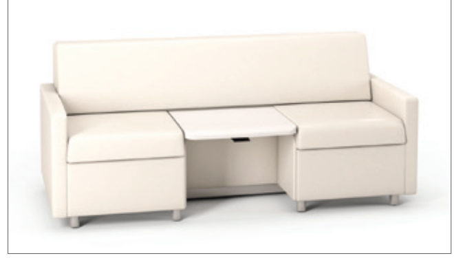
Modular Amelio with Height Adjustable Table in Down Position