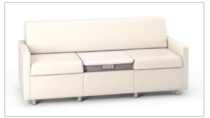
Modular Amelio with Fixed Height Table with Optional PowerDoc