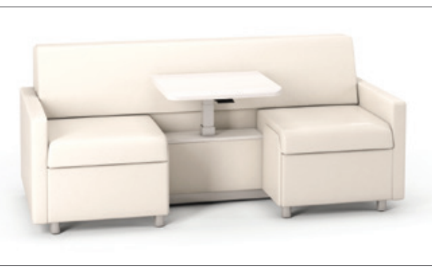
Modular Amelio with Height Adjustable Table in Up Position