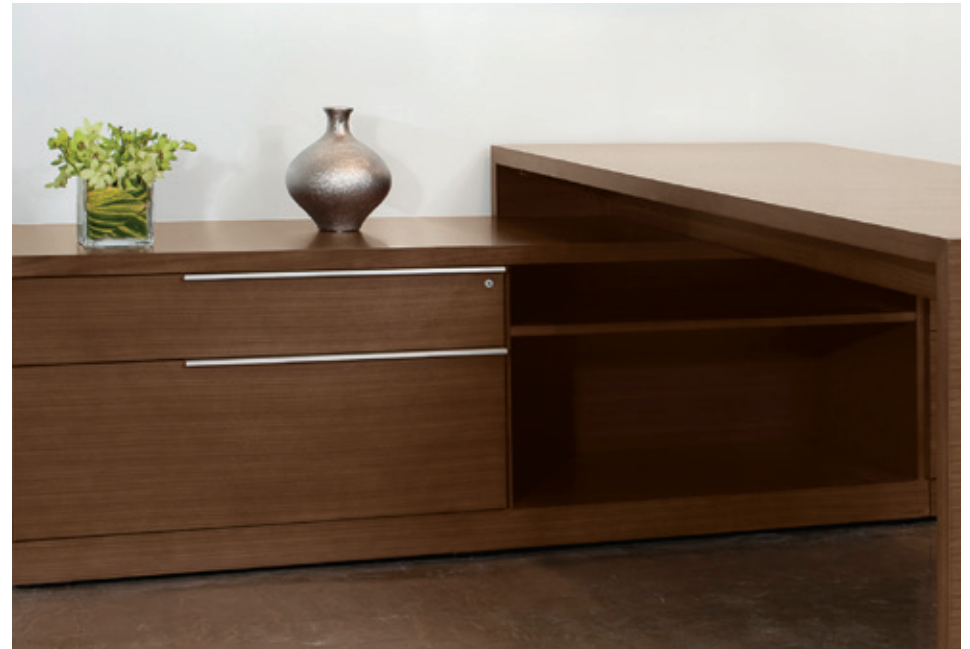
Storage unit and open bookcase