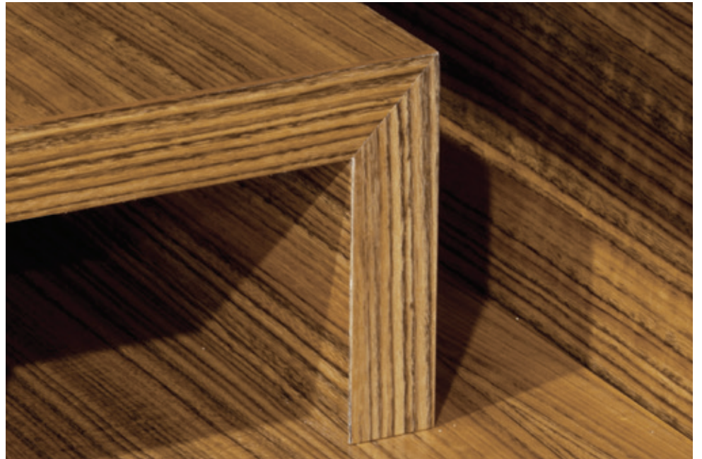
Mitered corner detail