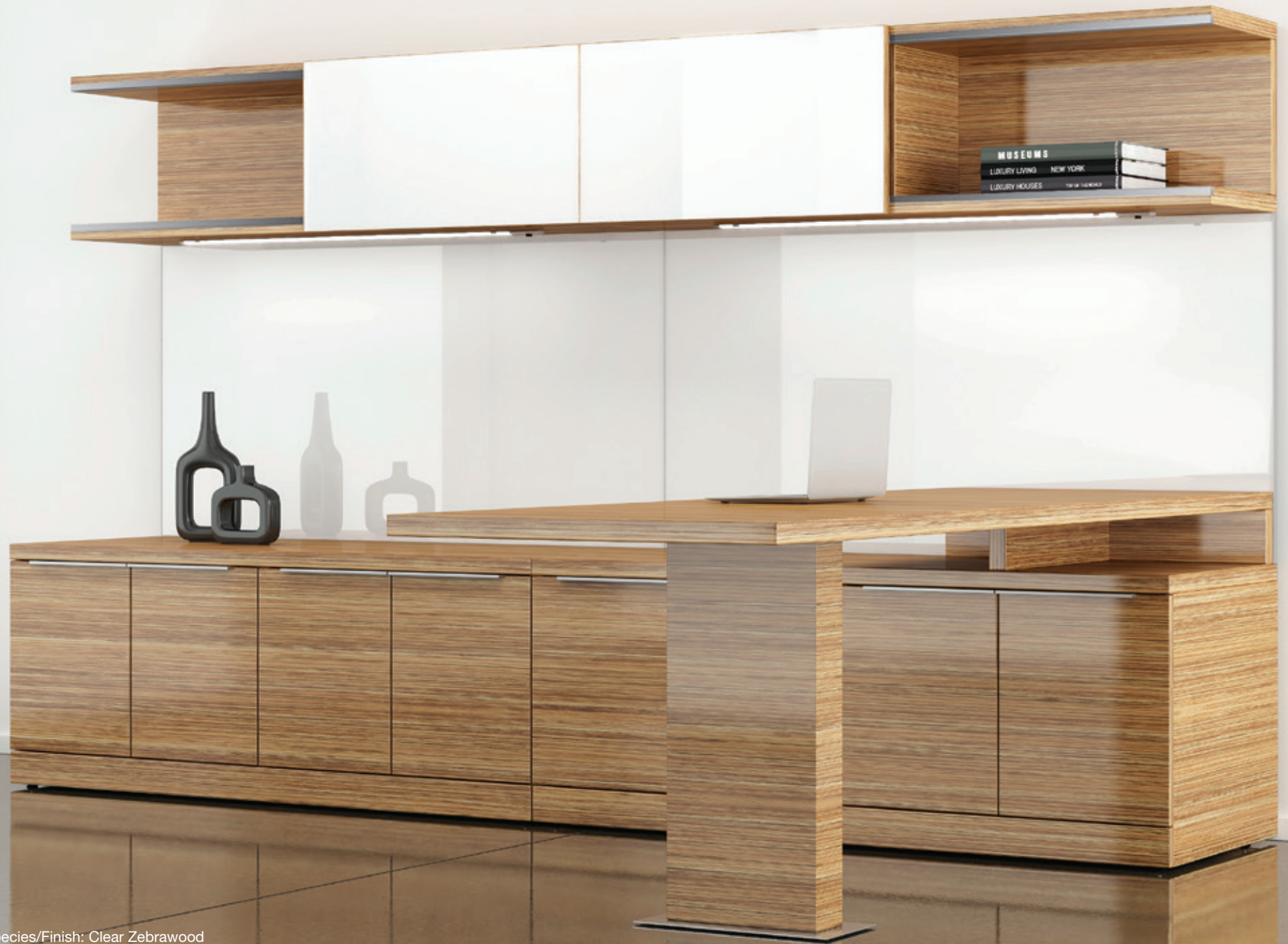
Wood Species/Finish: Clear Zebrawood