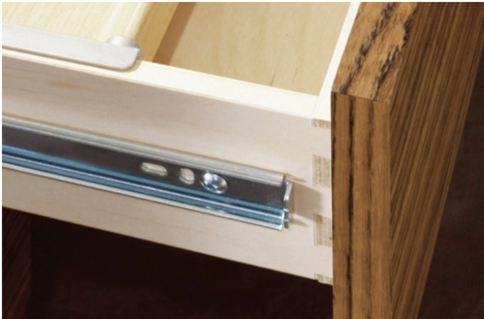
Hardwood drawers with dovetailed construction