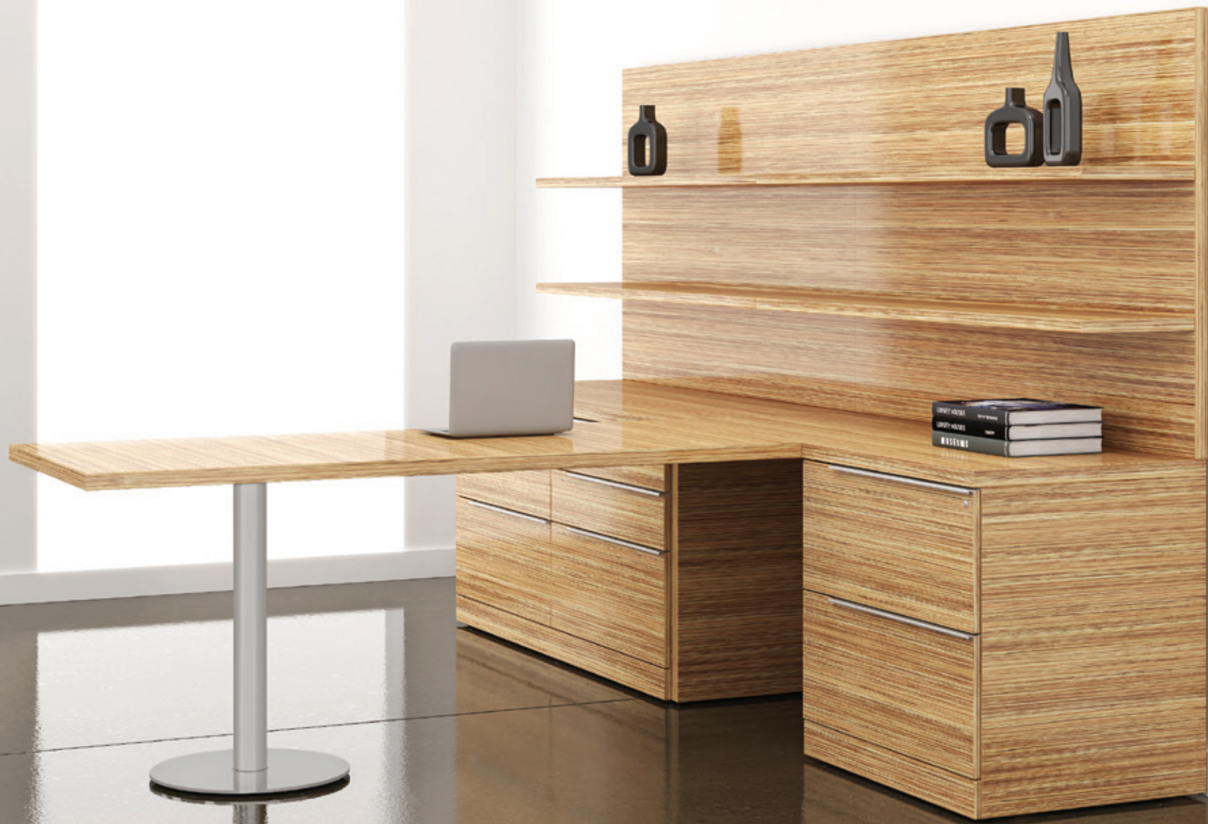
Wood Species/Finish: Clear Zebrawood