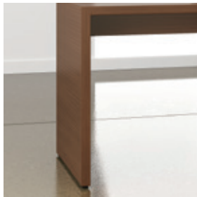
Wood Gable Base

Wall-hung panels - in both wood and back-painted glass - create useful and attractive open storage space that is functional and decorative. Optional dividers provide a filing space that keeps files in view and accessible, yet neat and organized. Closed storage can have either wood or back-painted glass doors - and on overhead storage these doors can also be sliding.