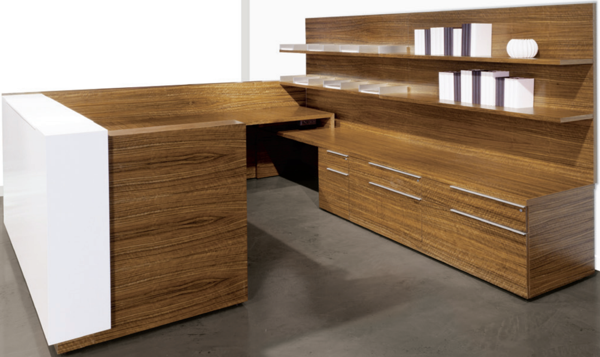
Wood Species/Finish: Clear Mozambique