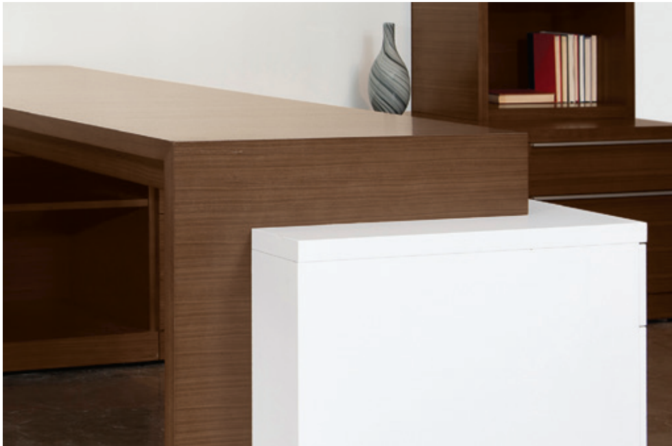
Desk return over pedestal