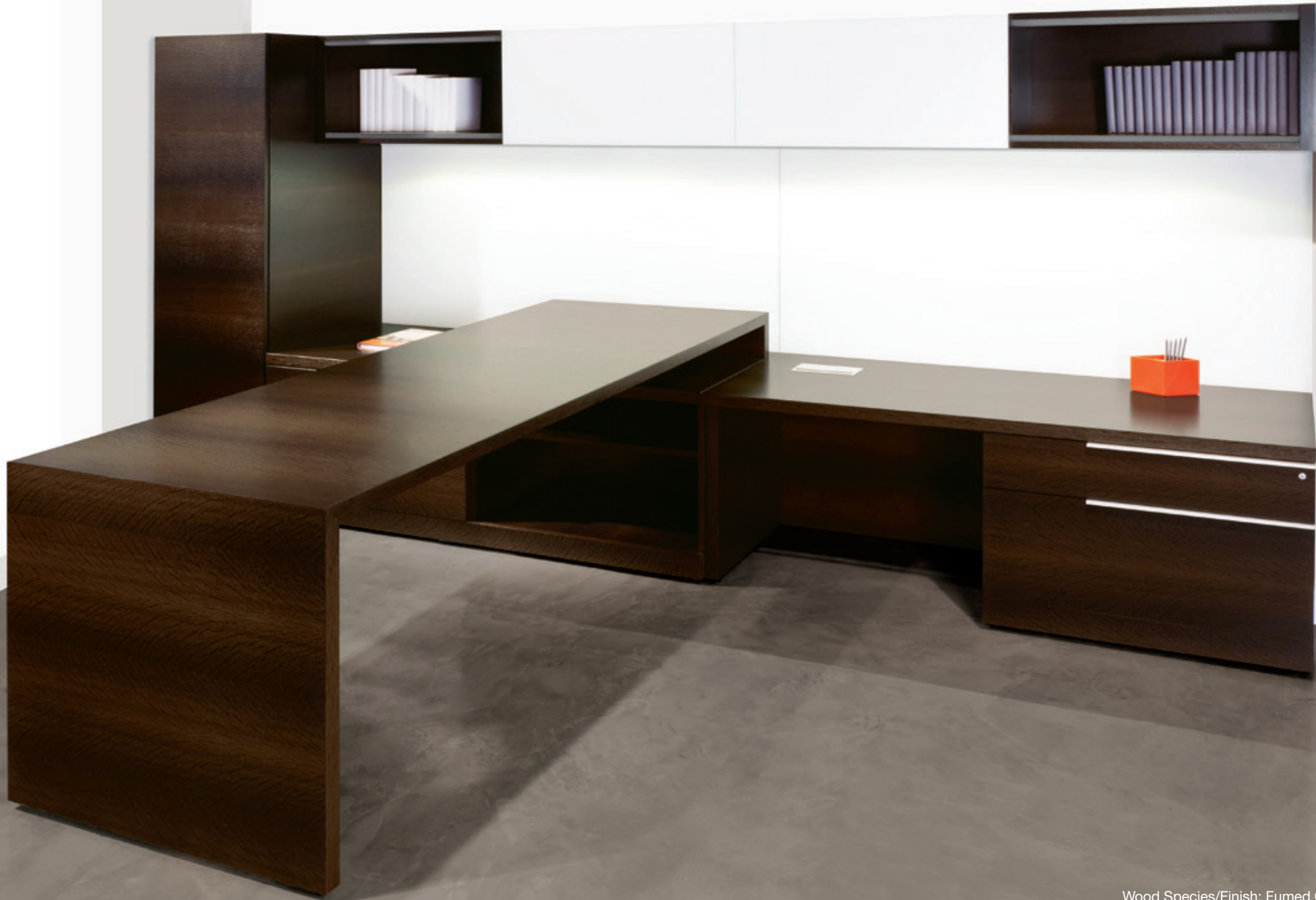
Wood Species/Finish: Fumed Oak