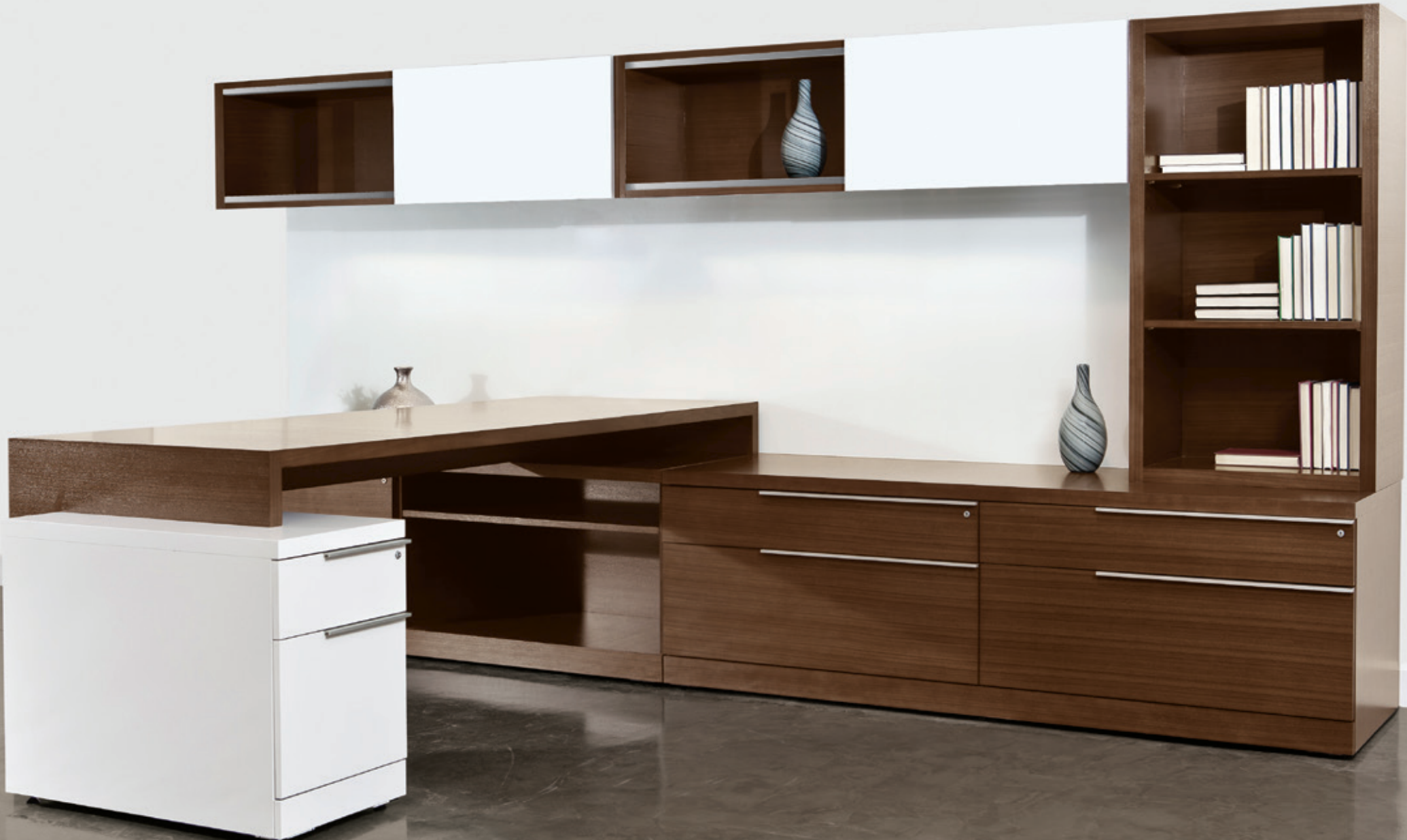
Wood Species/Finish: Natural Walnut & White Palette