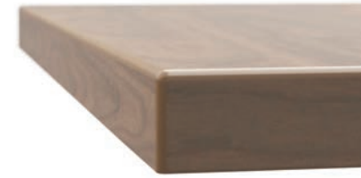
RADIUS EDGE - D