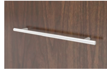
SONO PULL -SILVER METALLIC