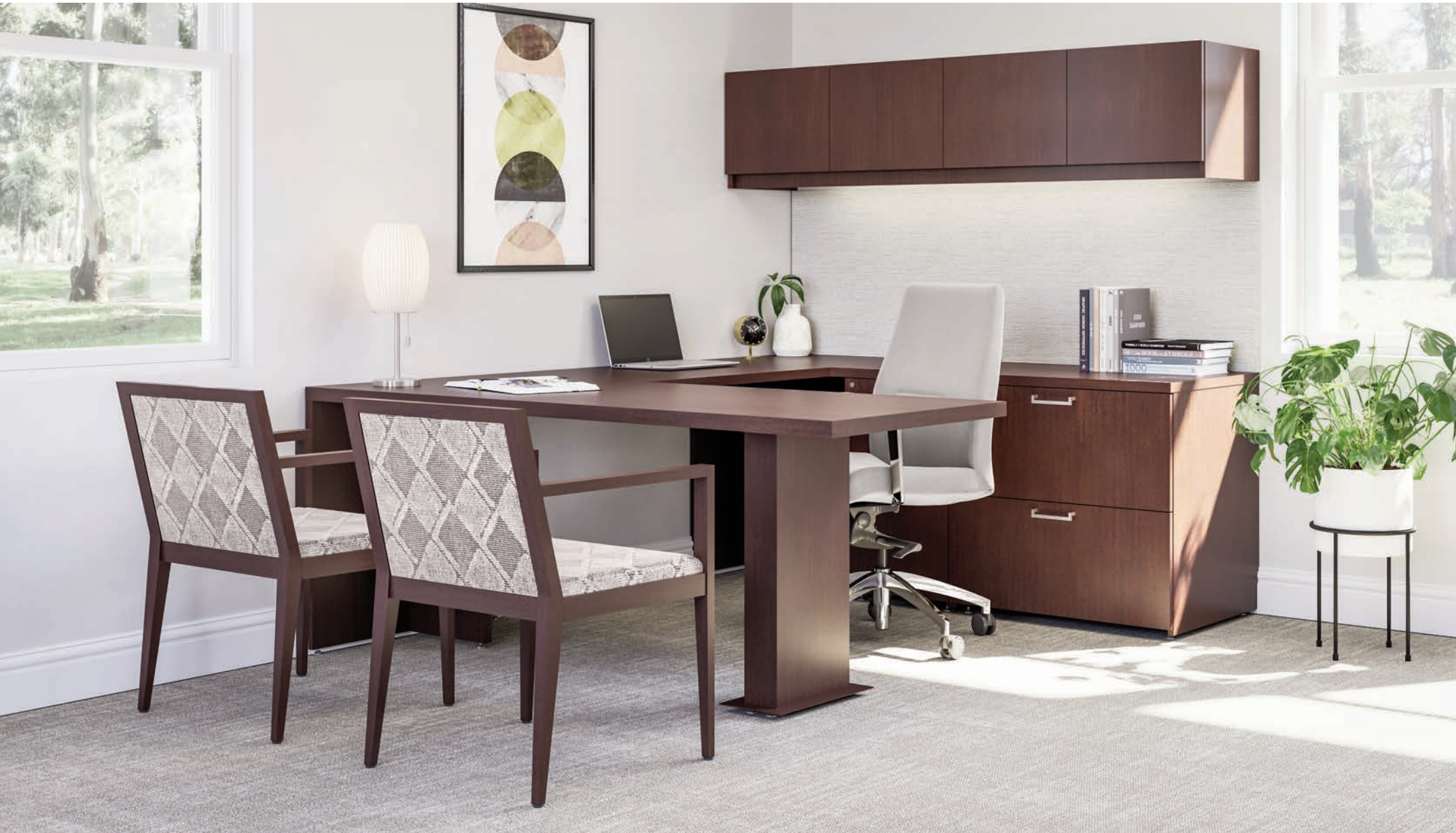
Wall-hung overheads & panels create useful and attractive storage space that is functional and decorative.