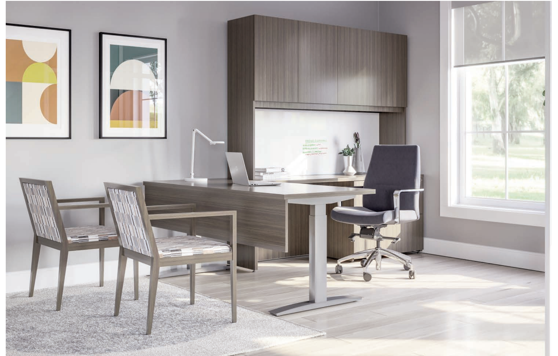
Height Adjustable Base