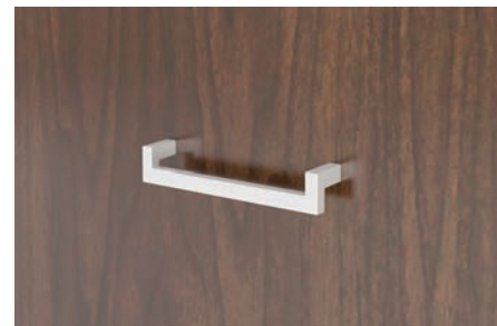
DIANA PULL -SILVER METALLIC