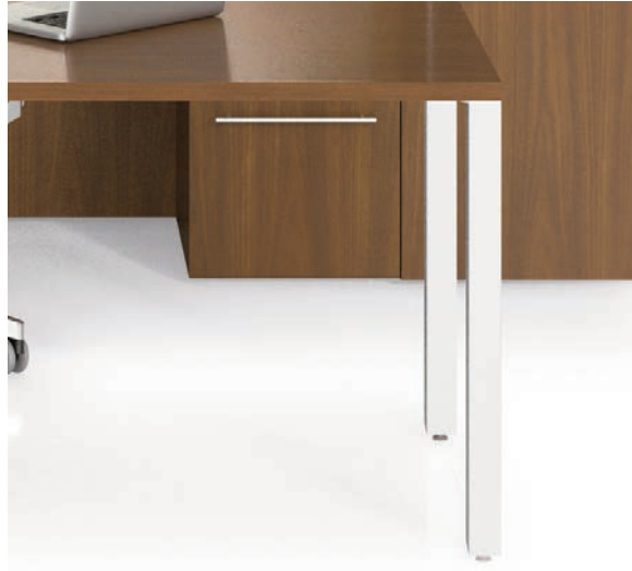
Square Metal Legs