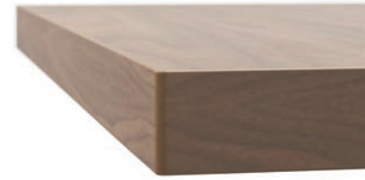
FLAT EDGE - T