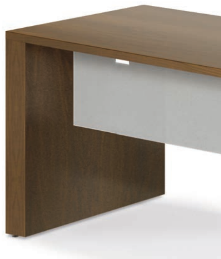
4" Gable Base