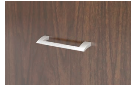
HERA PULL -SILVER METALLIC