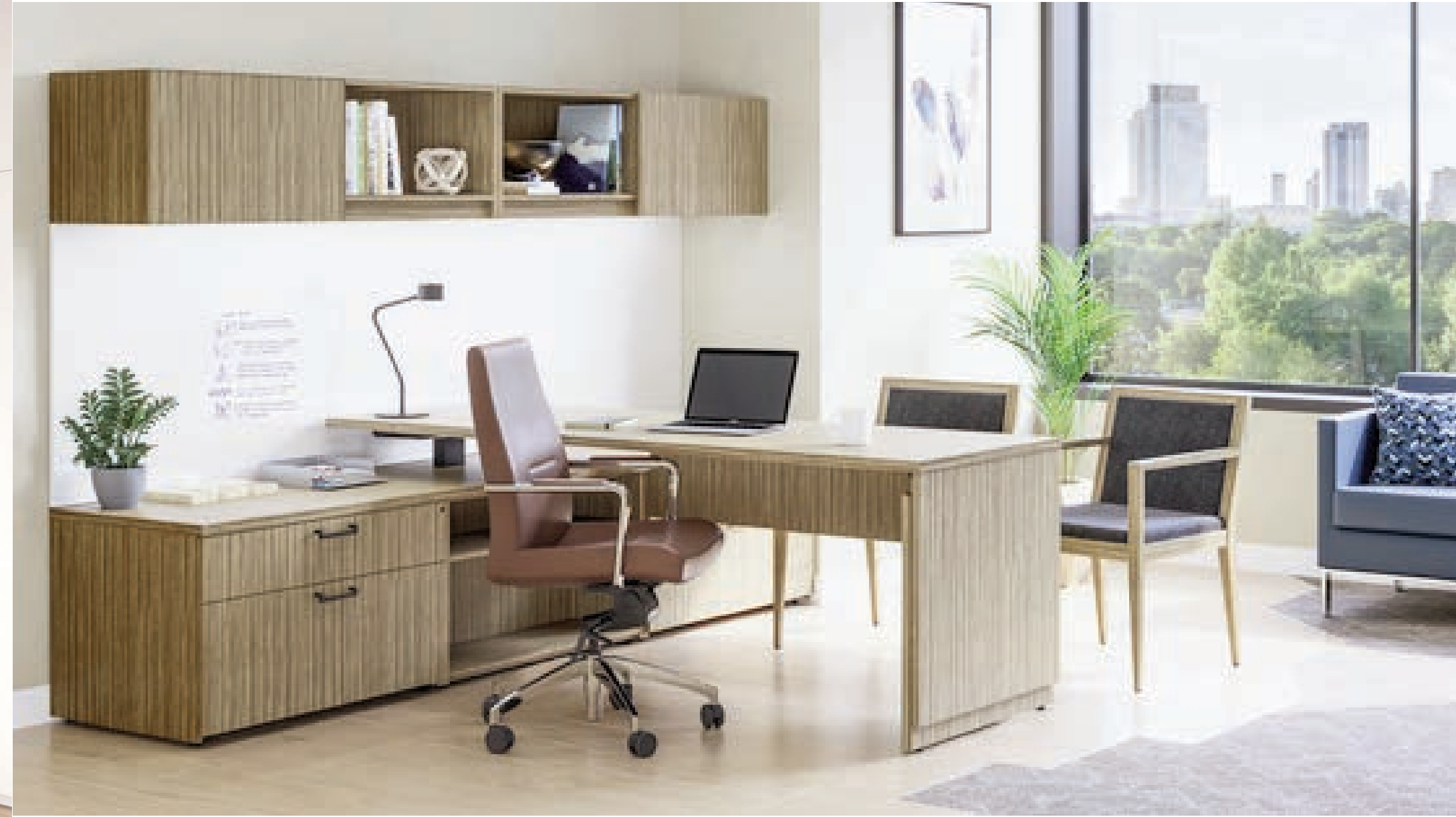
The lower-height credenza configuration provides a sleek, contemporary look.