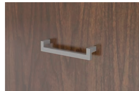
DIANA PULL -GREY METALLIC