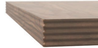
FLUTED EDGE - M