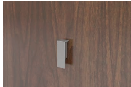
ATHENA PULL -GREY METALLIC