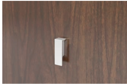
ATHENA PULL -SILVER METALLIC