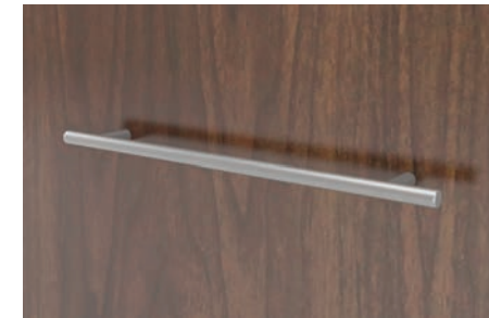
SONO PULL -GREY METALLIC