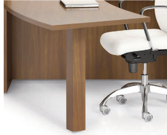
Square Wood Leg