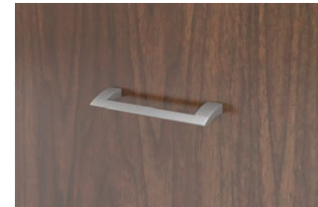
HERA PULL -GREY METALLIC