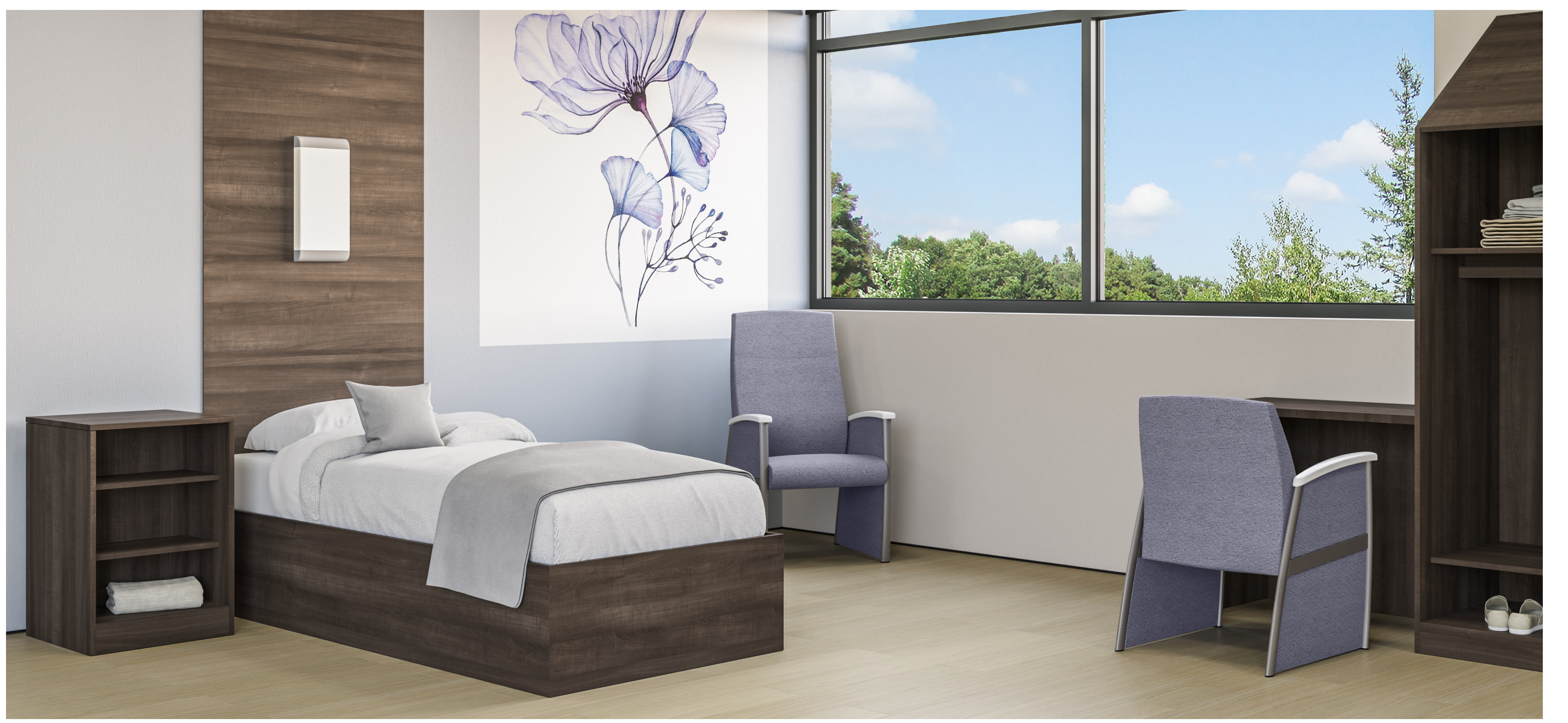
Juno & Solis Behavioral Health