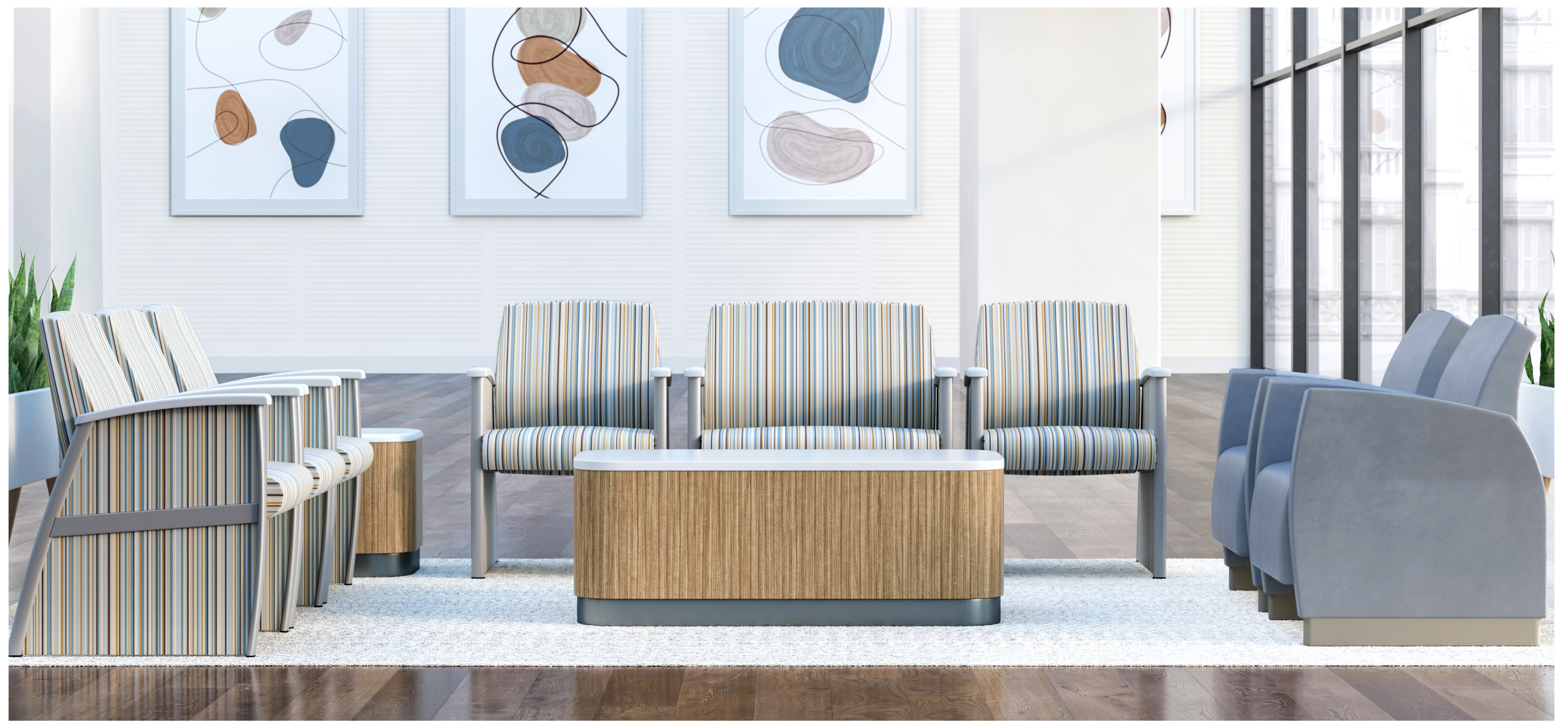
Solis & Zola Behavioral Health