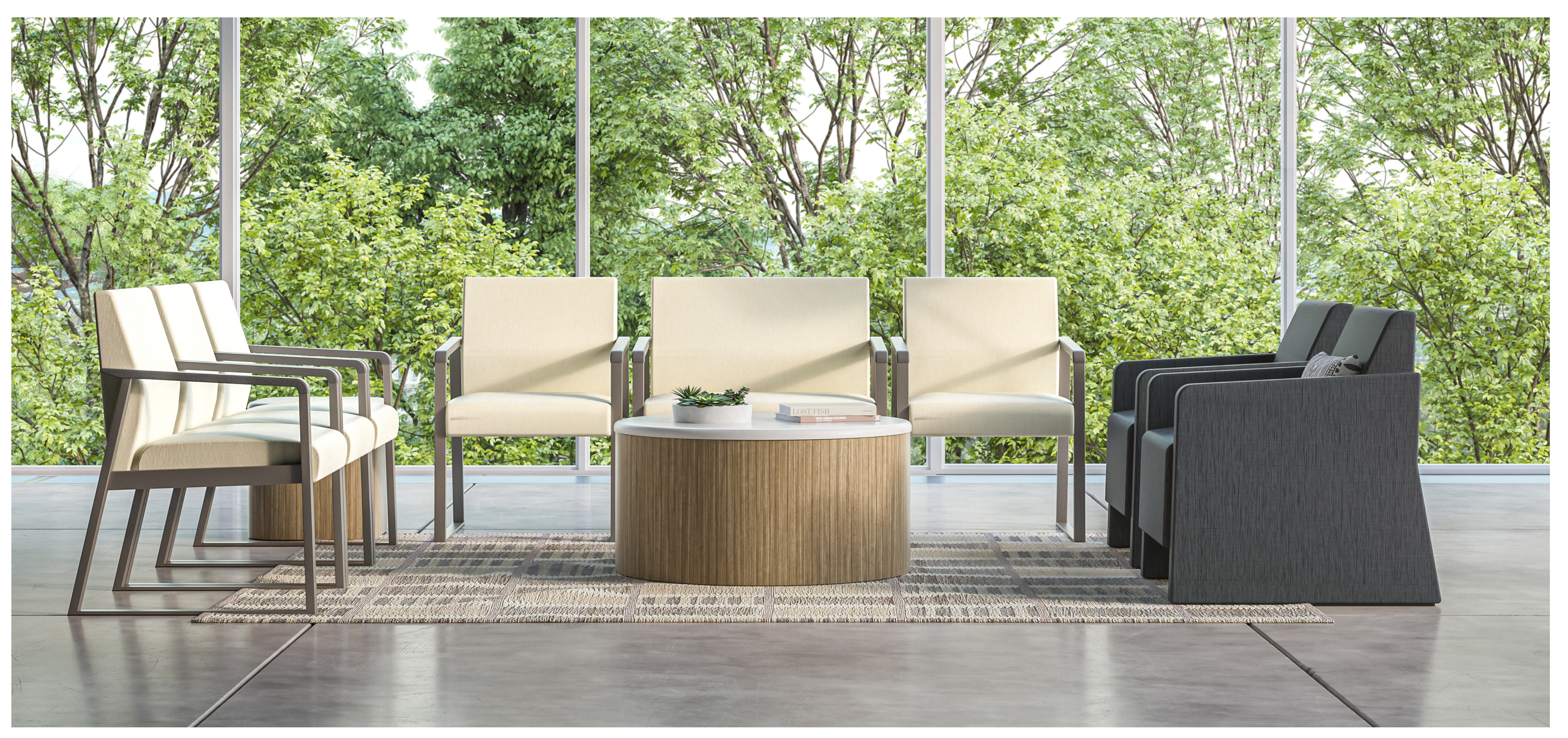
Faeron & Zola Behavioral Health