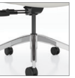
Black Knee Tilt