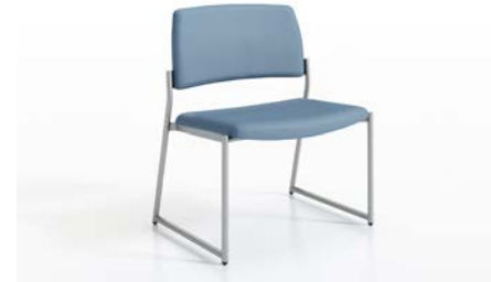
26" Sled Base