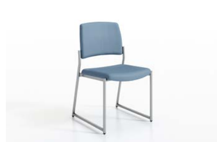
18.5" Sled Base

Karma has been laboratory tested to meet a weight capacity of 500 lbs.