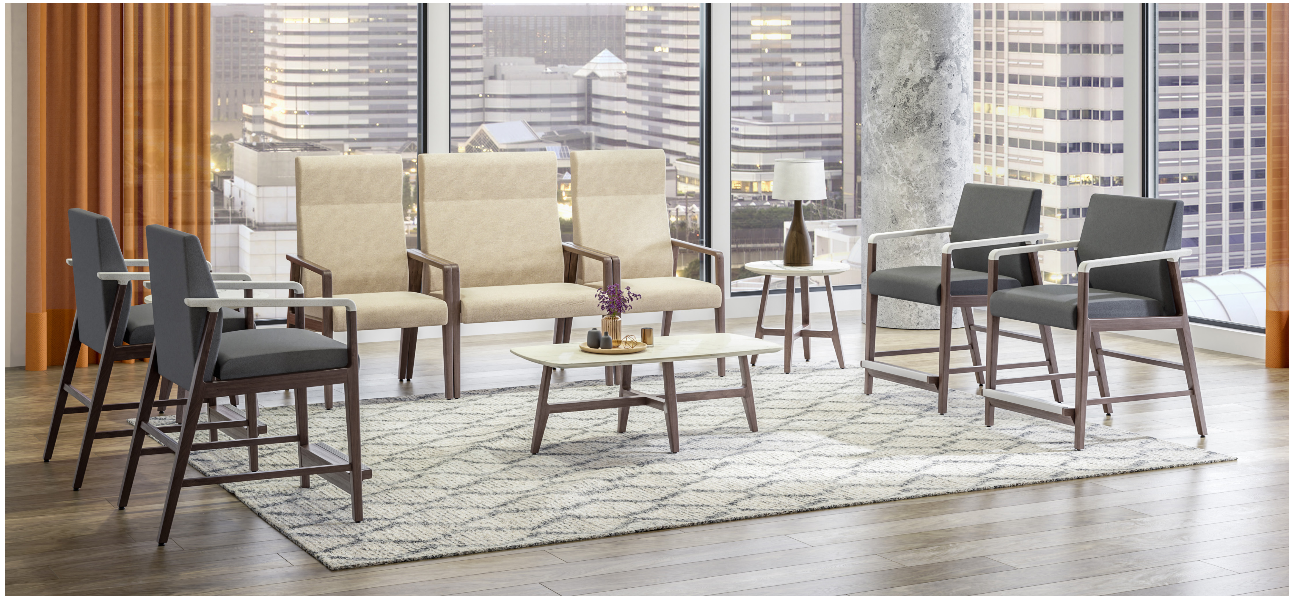
Faeron Wood Patient & Easy Access