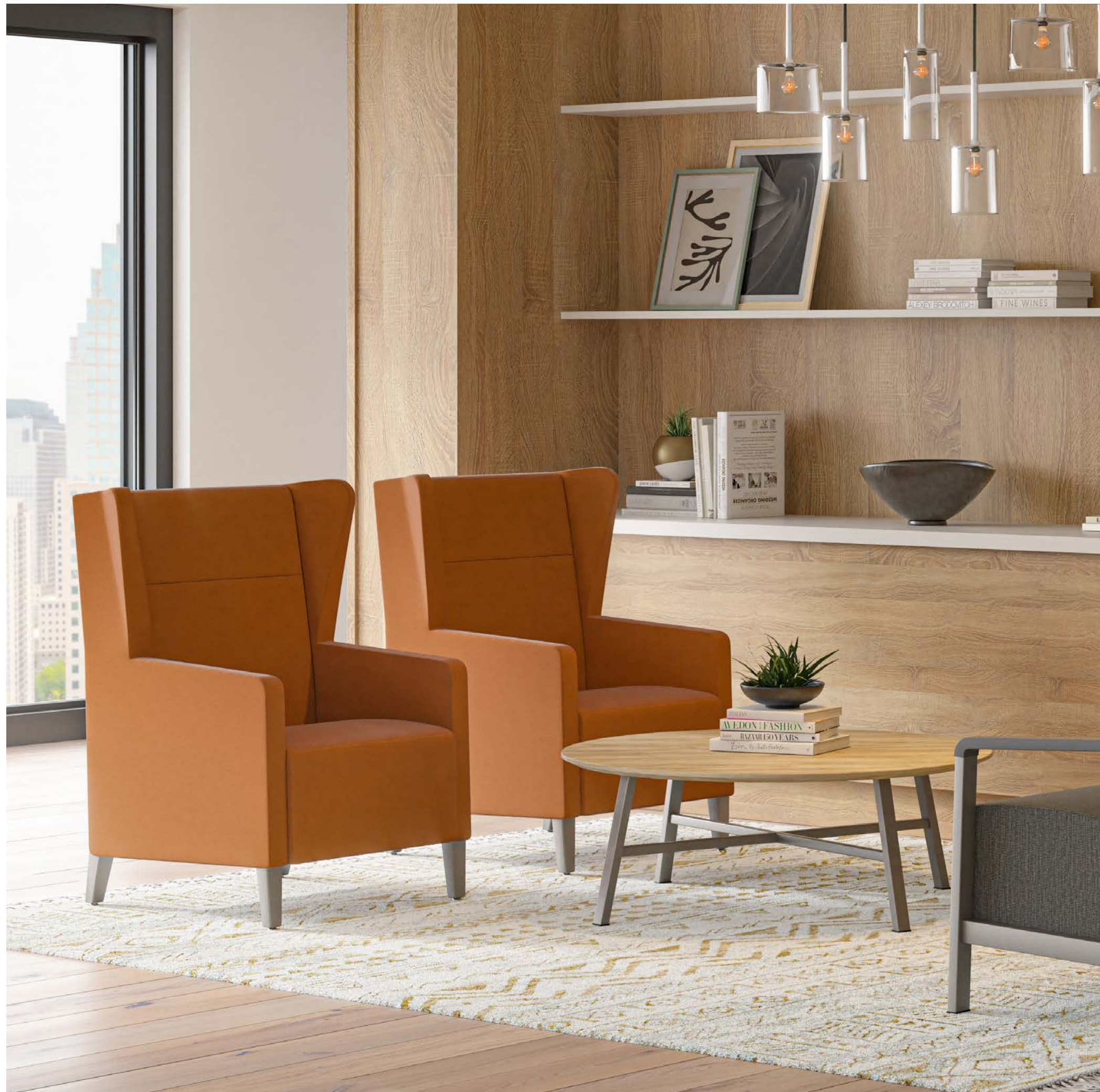
Faeron Metal Wing Back Lounge