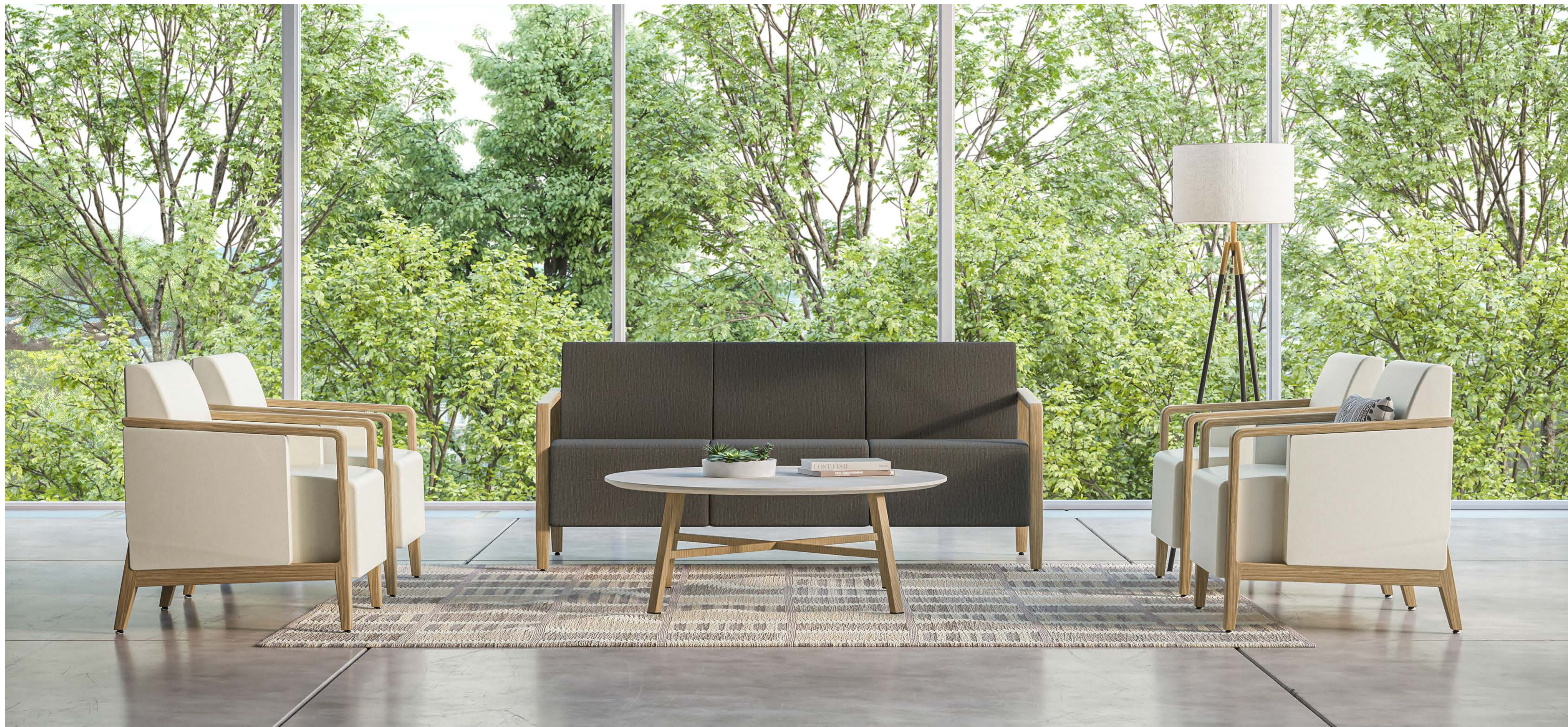
Faeron Wood Lounge featuring semi-closed arms