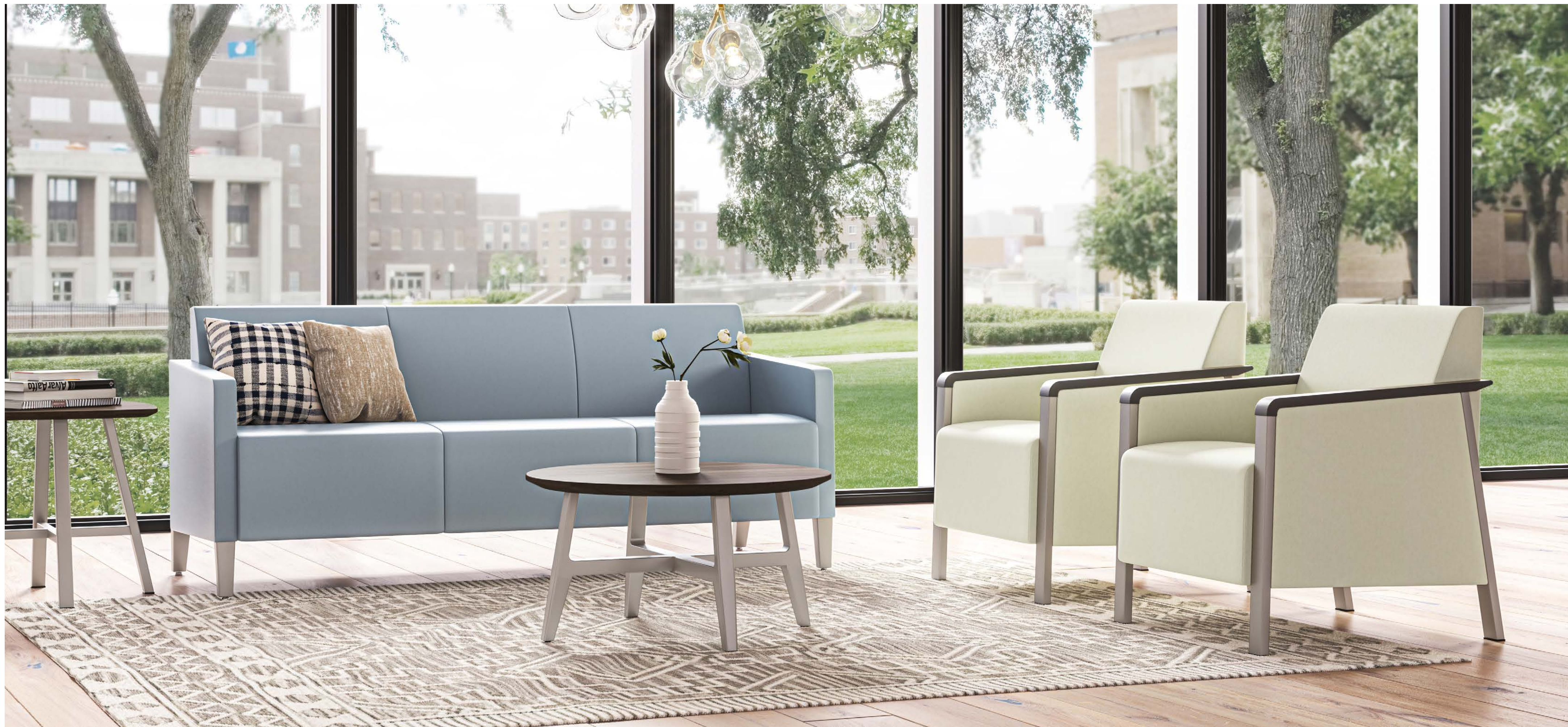
Faeron Metal Lounge featuring upholstered & closed arms