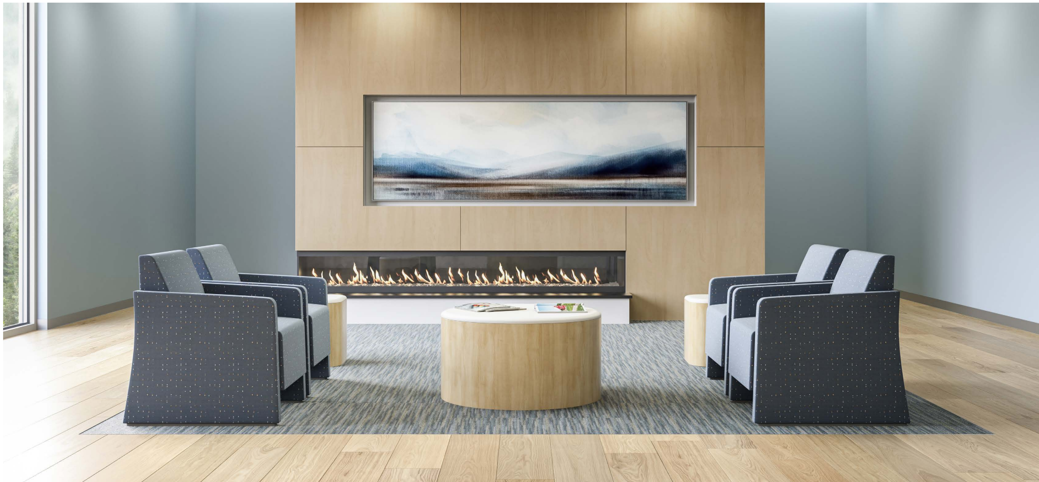
Faeron Behavioral Health Lounge with Zola Behavioral Health tables