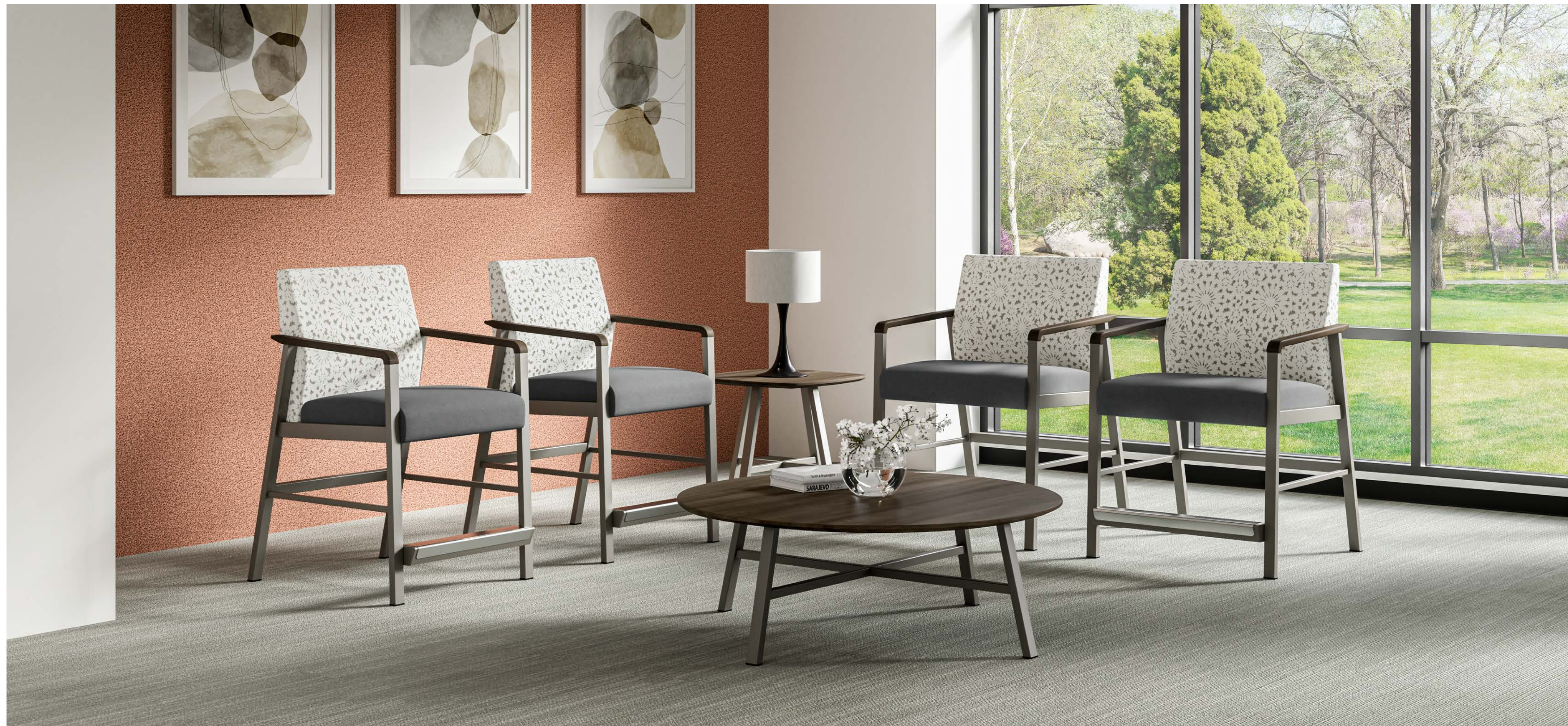
Faeron Metal Easy Access