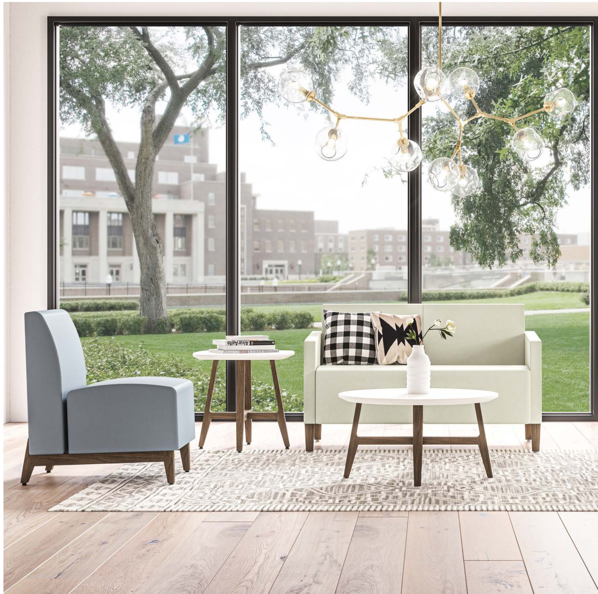
Faeron Wood Lounge featuring armless and upholstered arms