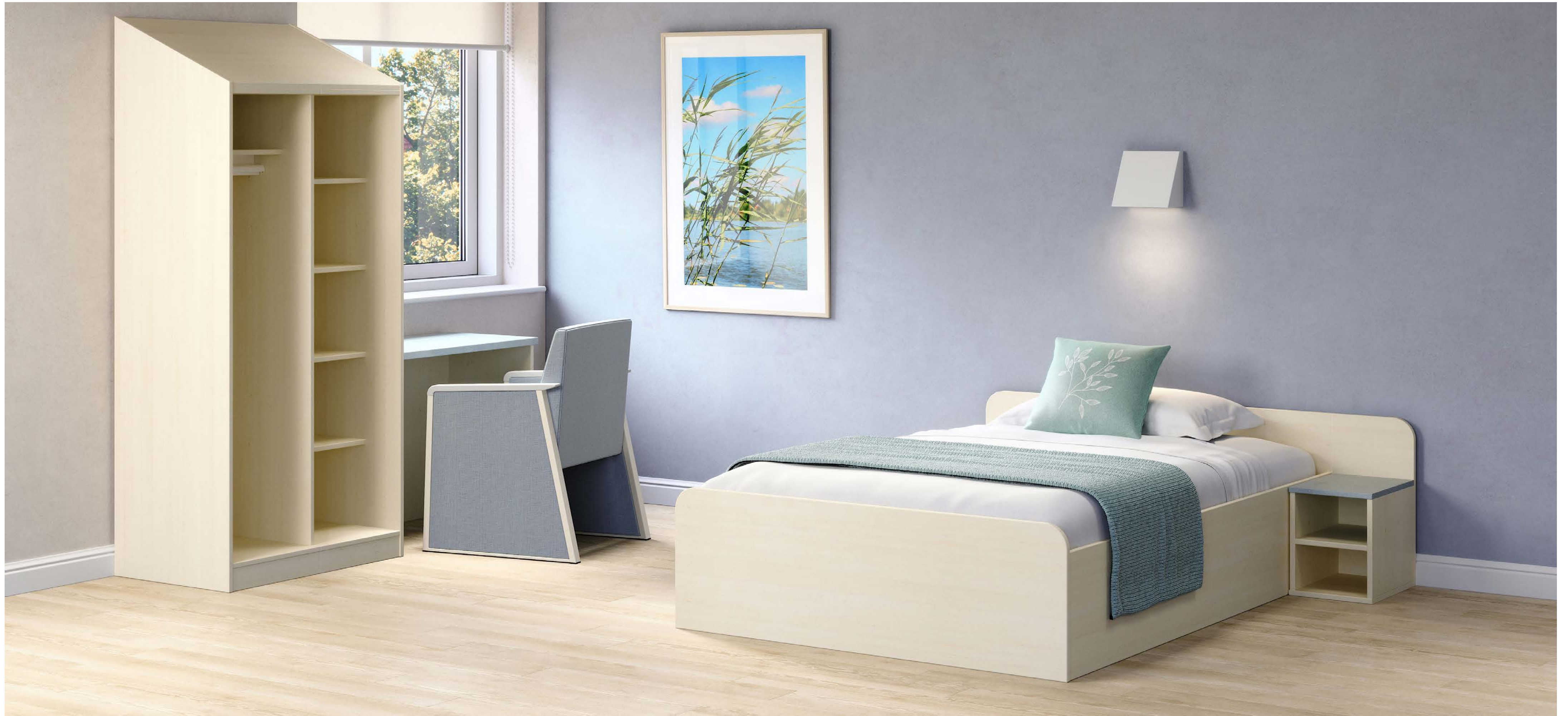
Faeron Behavioral Health Guest with Juno Caseloads