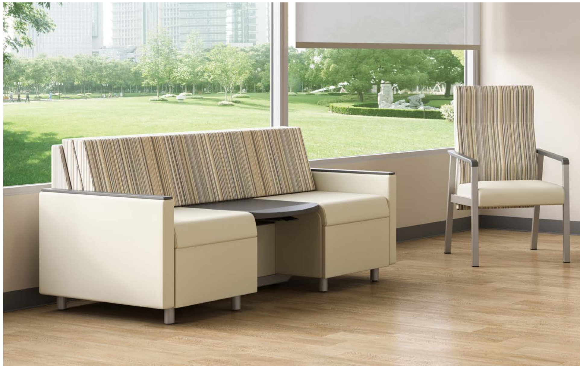
Amelio Modular Sleeper