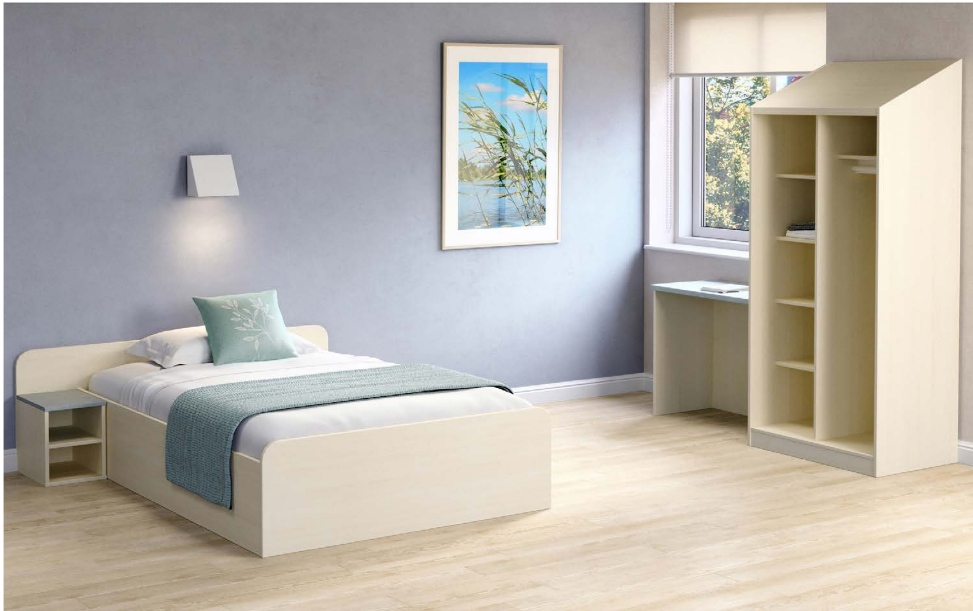
Juno Behavioral Health