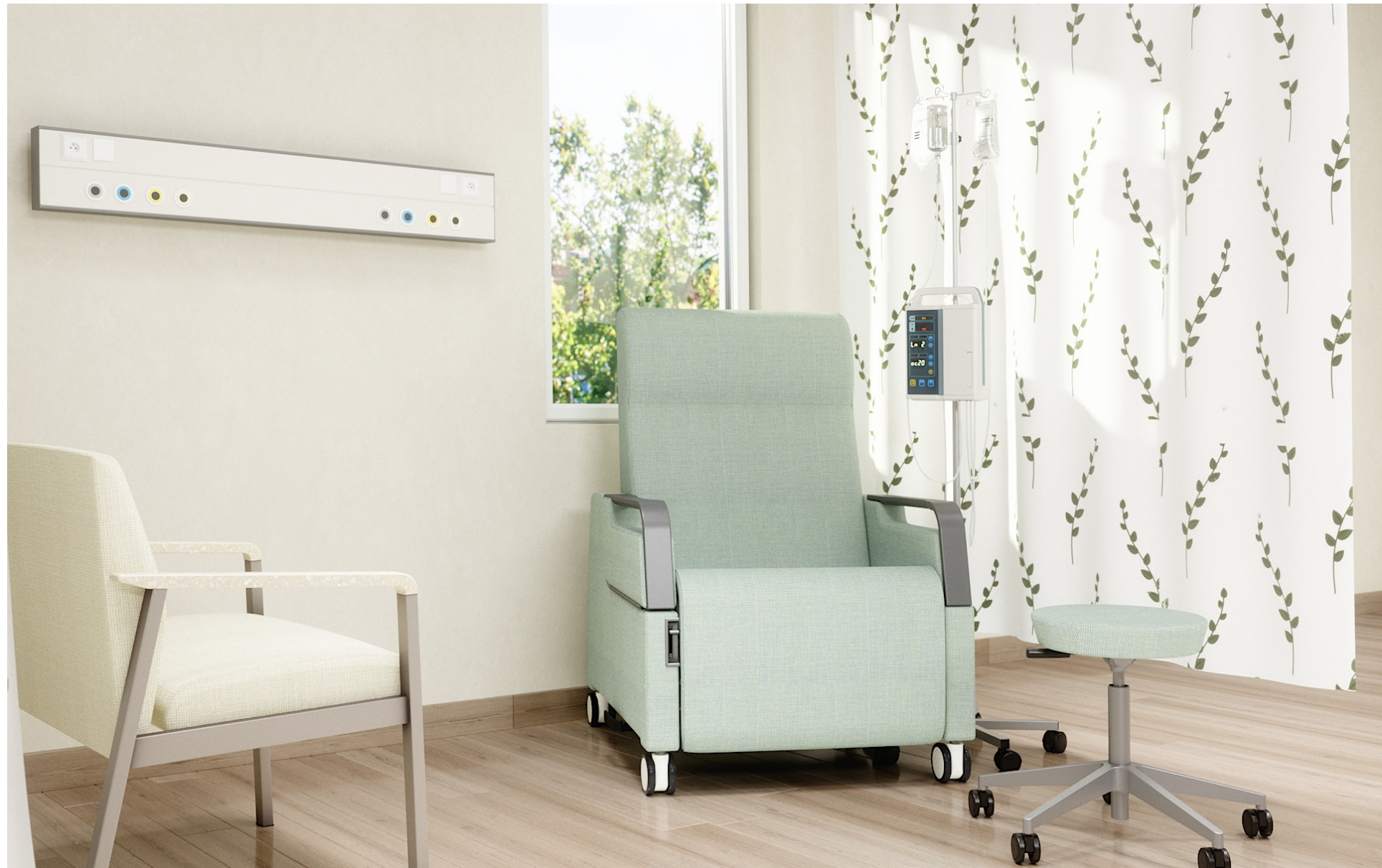
Ascend Exam Recliner