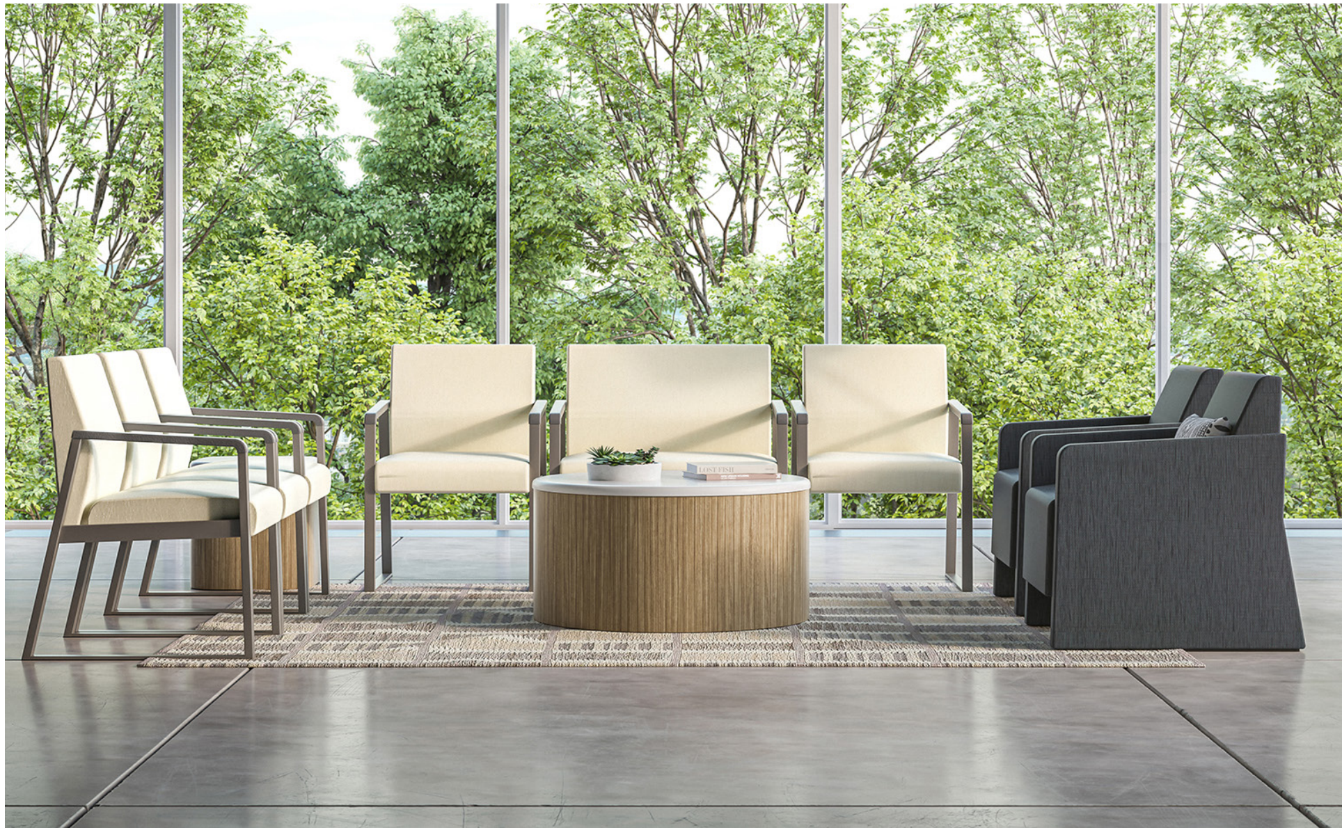
Faeron Behavioral Health