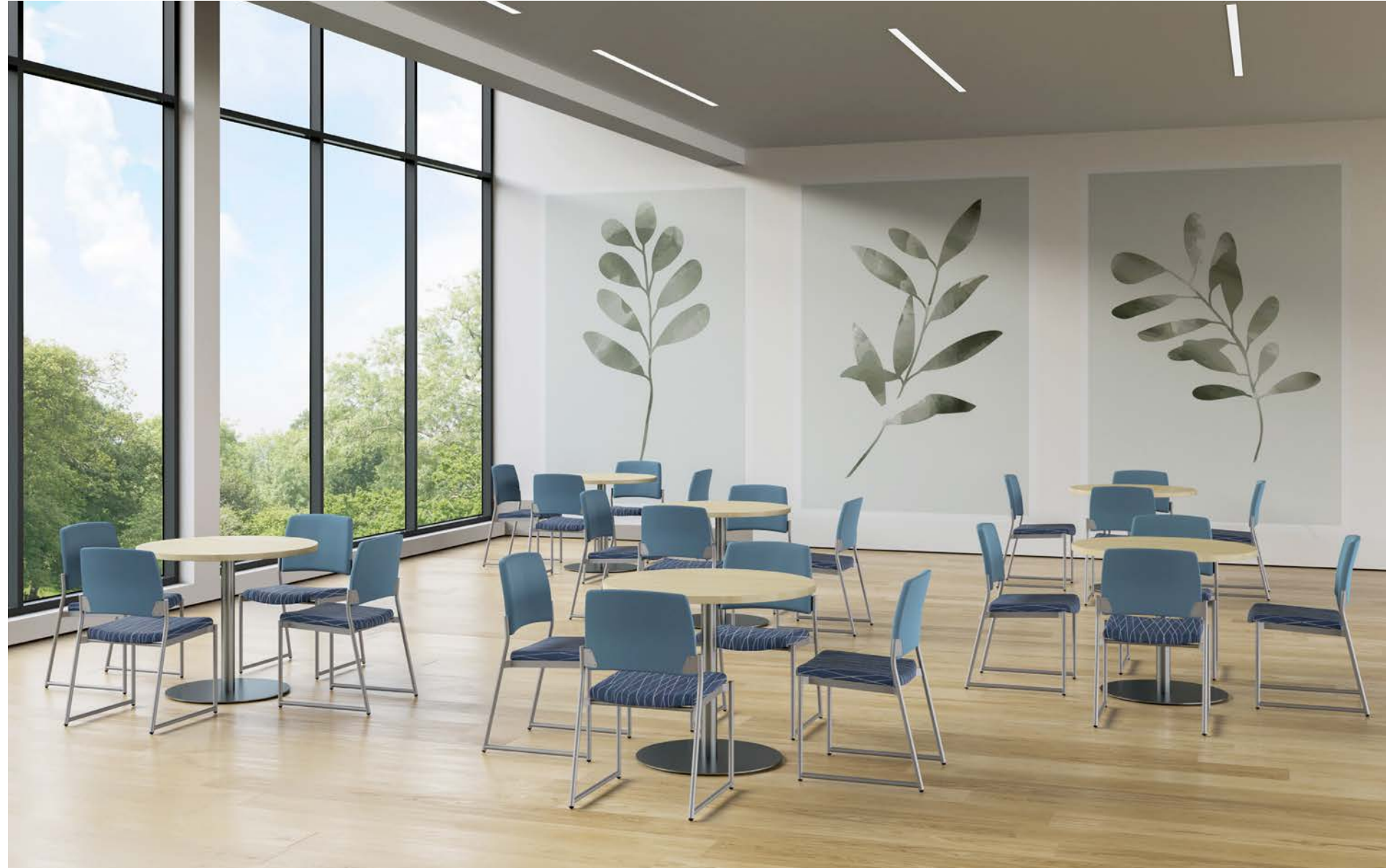
Karma Behavioral Health