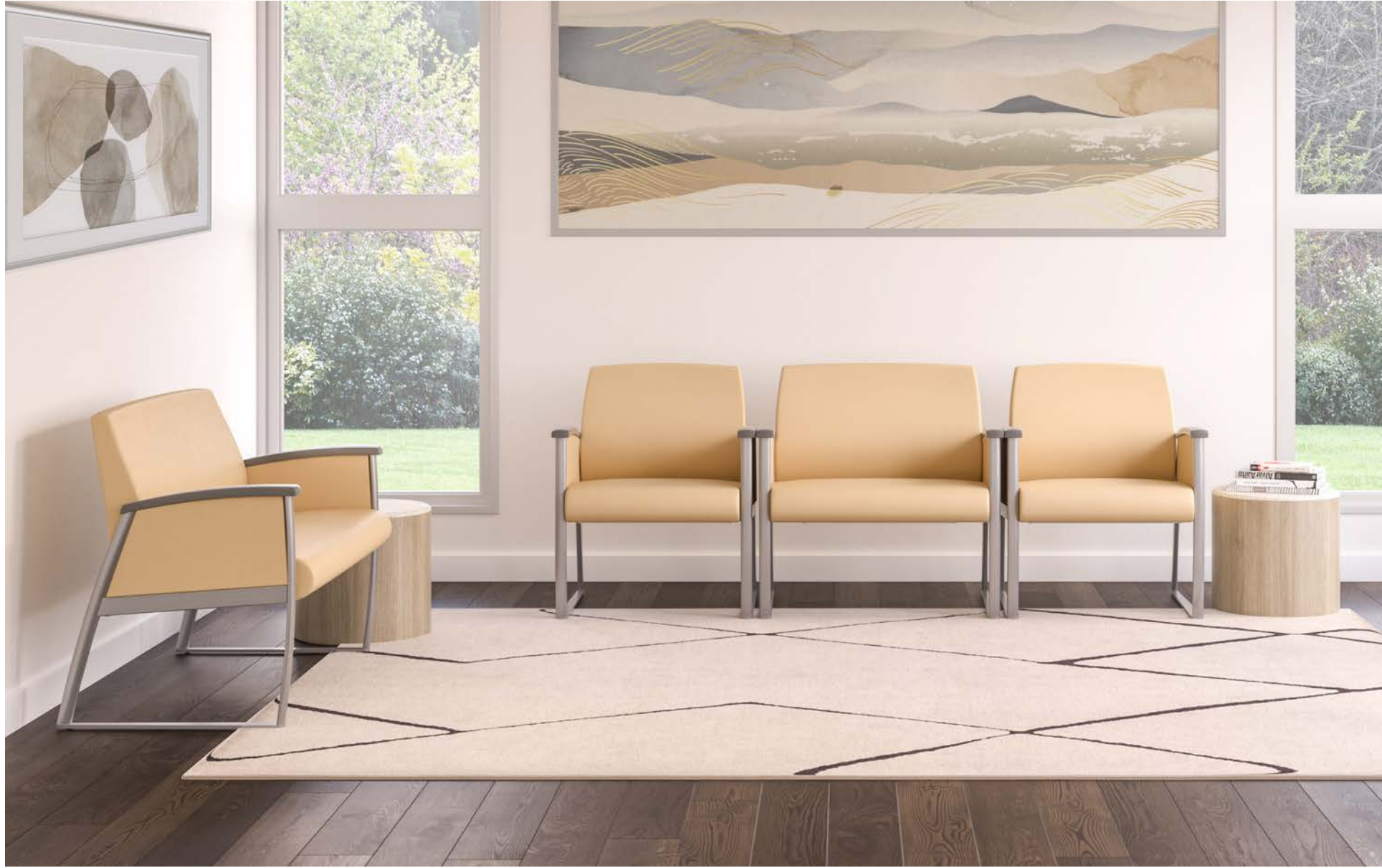
Solis Behavioral Health