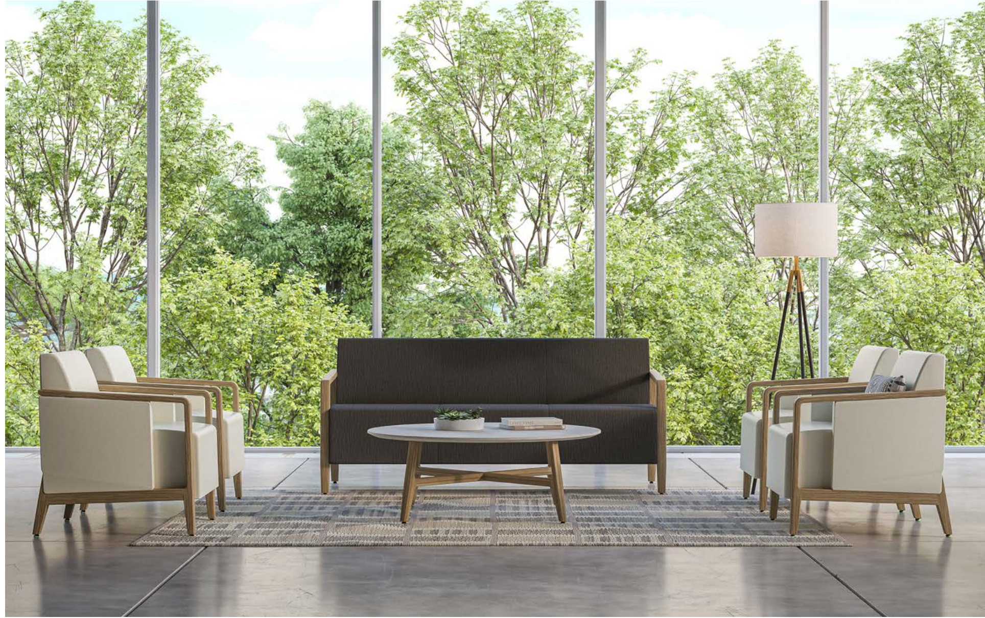
Faeron Wood Lounge