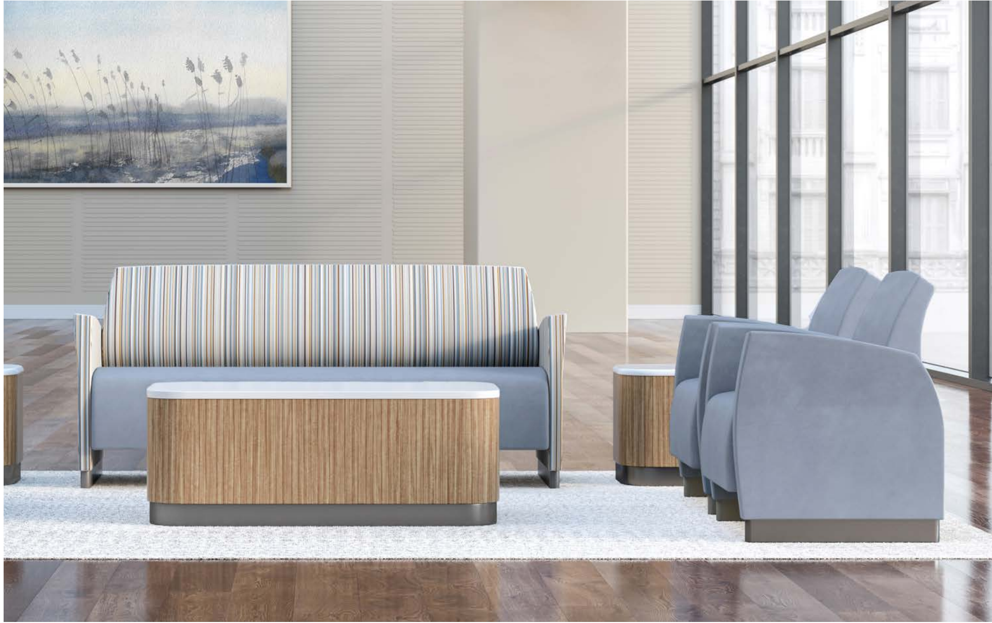
Zola Behavioral Health