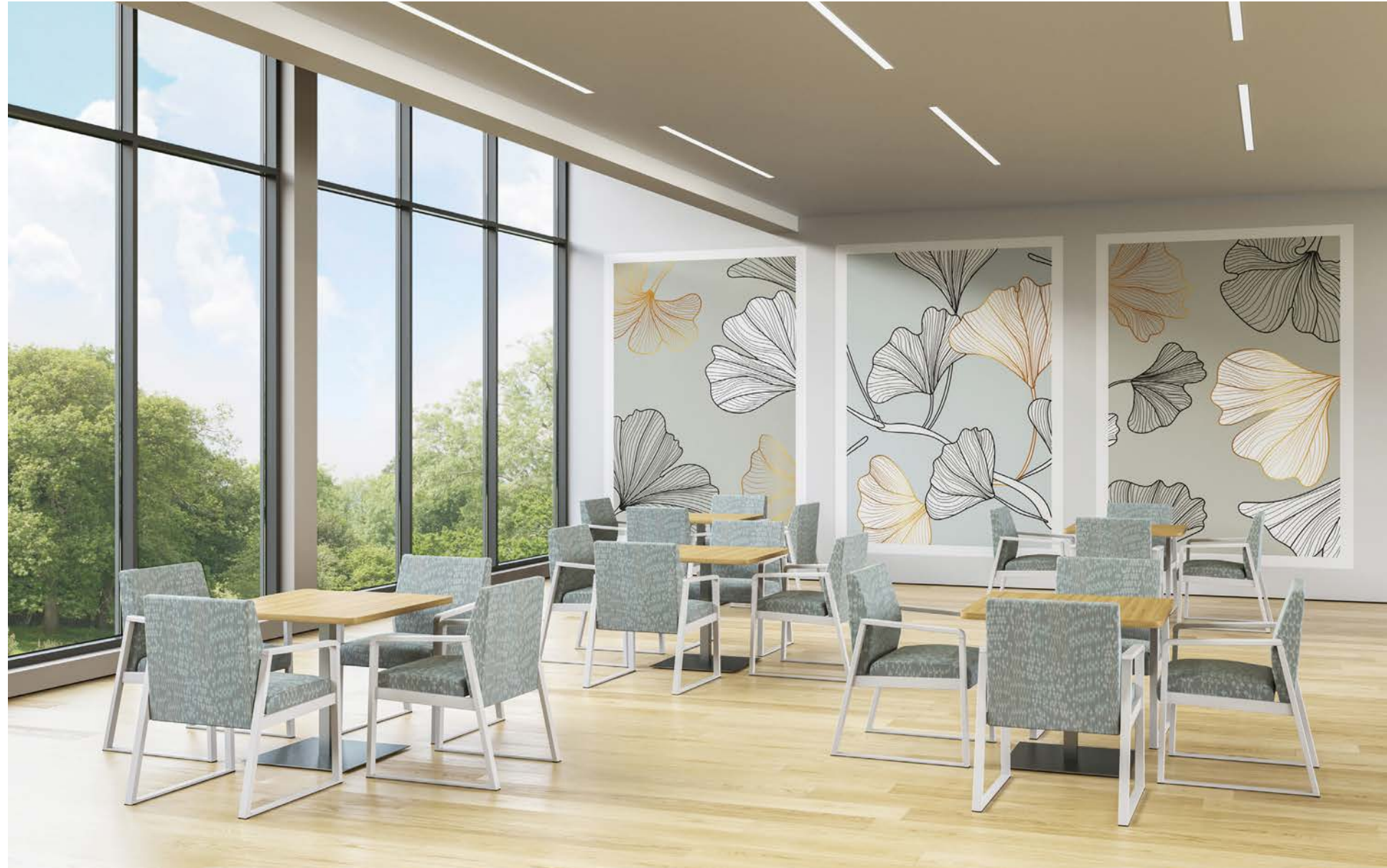
Chit Chat Behavioral Health