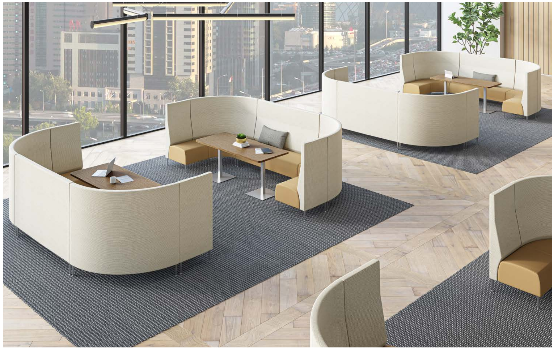
Zola Privacy Lounge