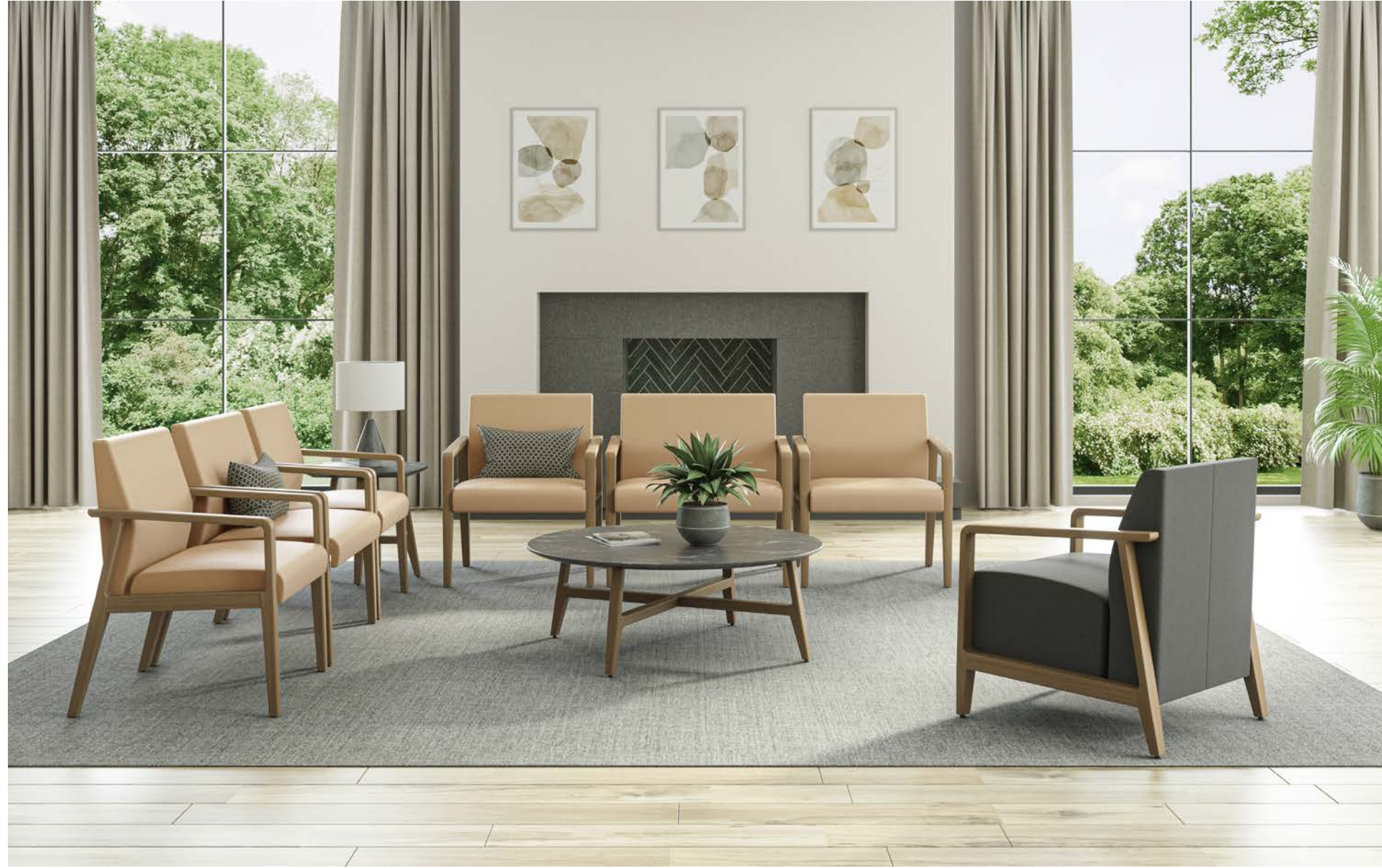
Faeron Wood Guest