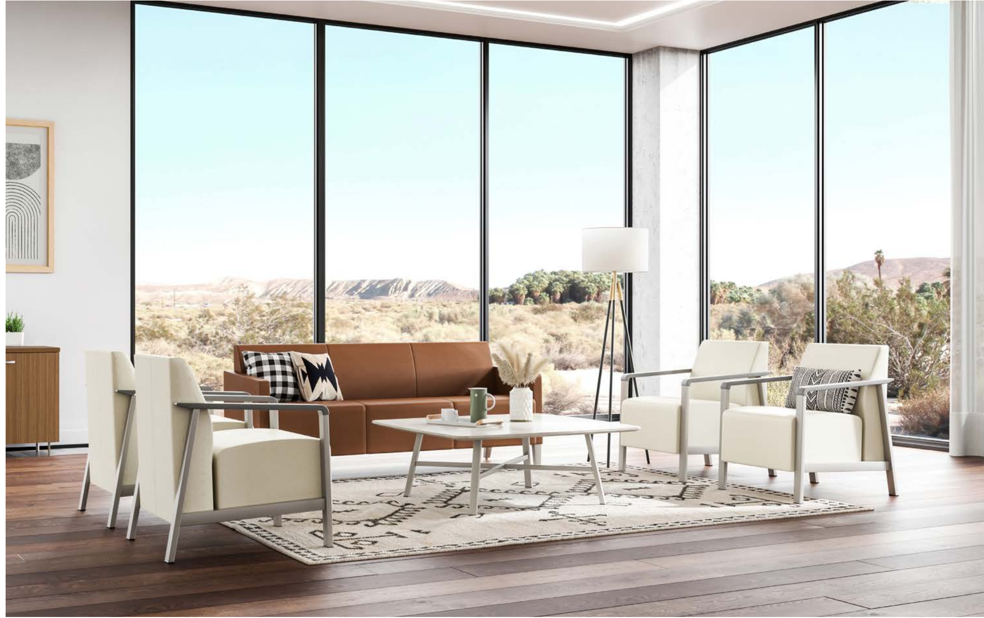
Faeron Metal Lounge