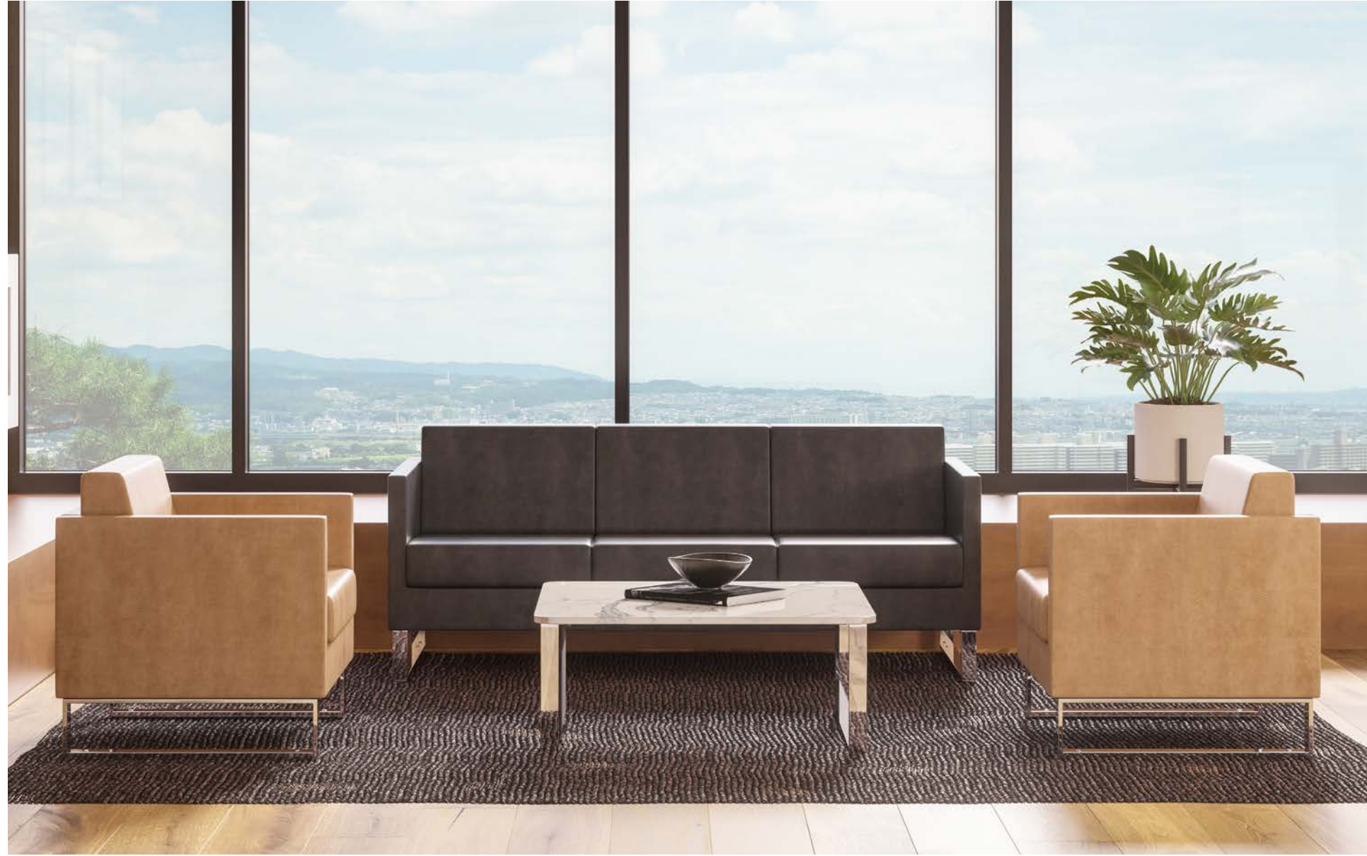
Leyton Behavioral Health