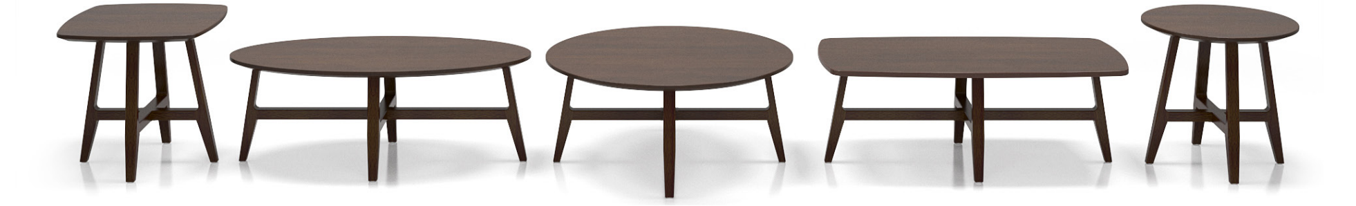
Faeron Wood Tables