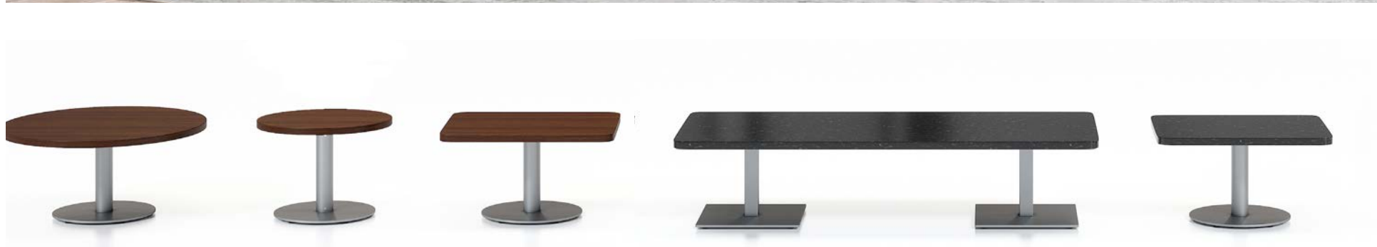
Chit Chat Tables