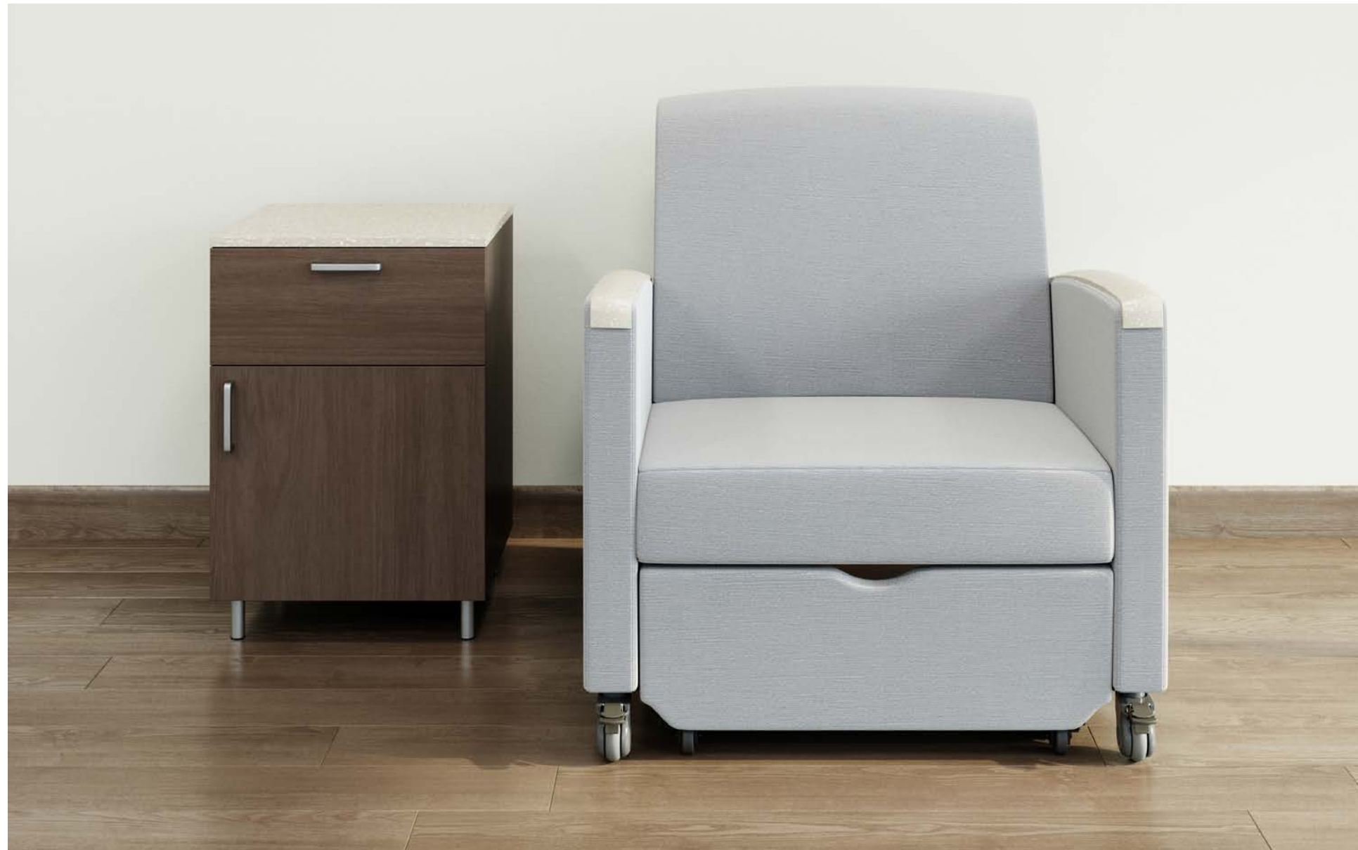
Jordan Lounge Sleeper