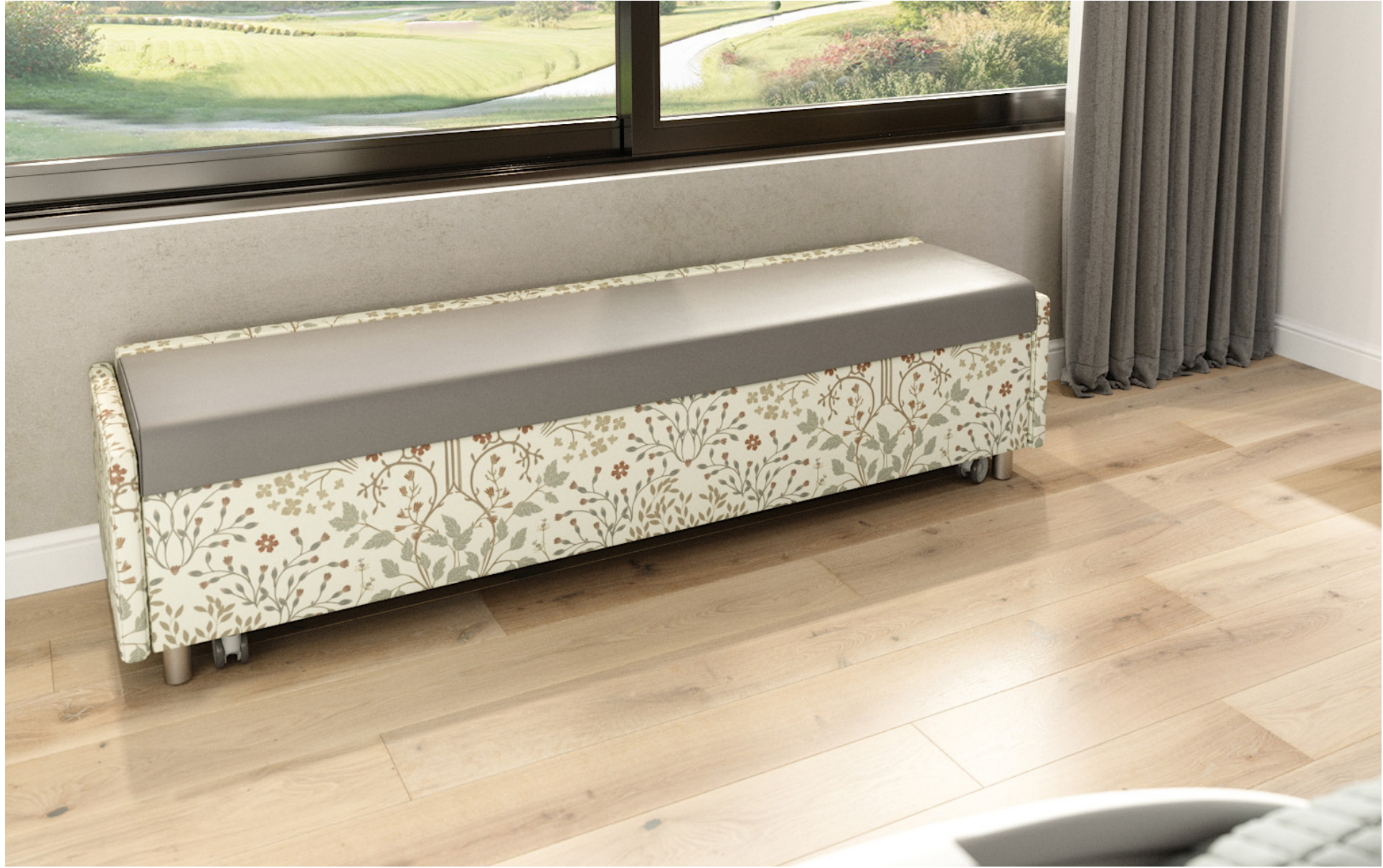
Amelio Bench Sleeper