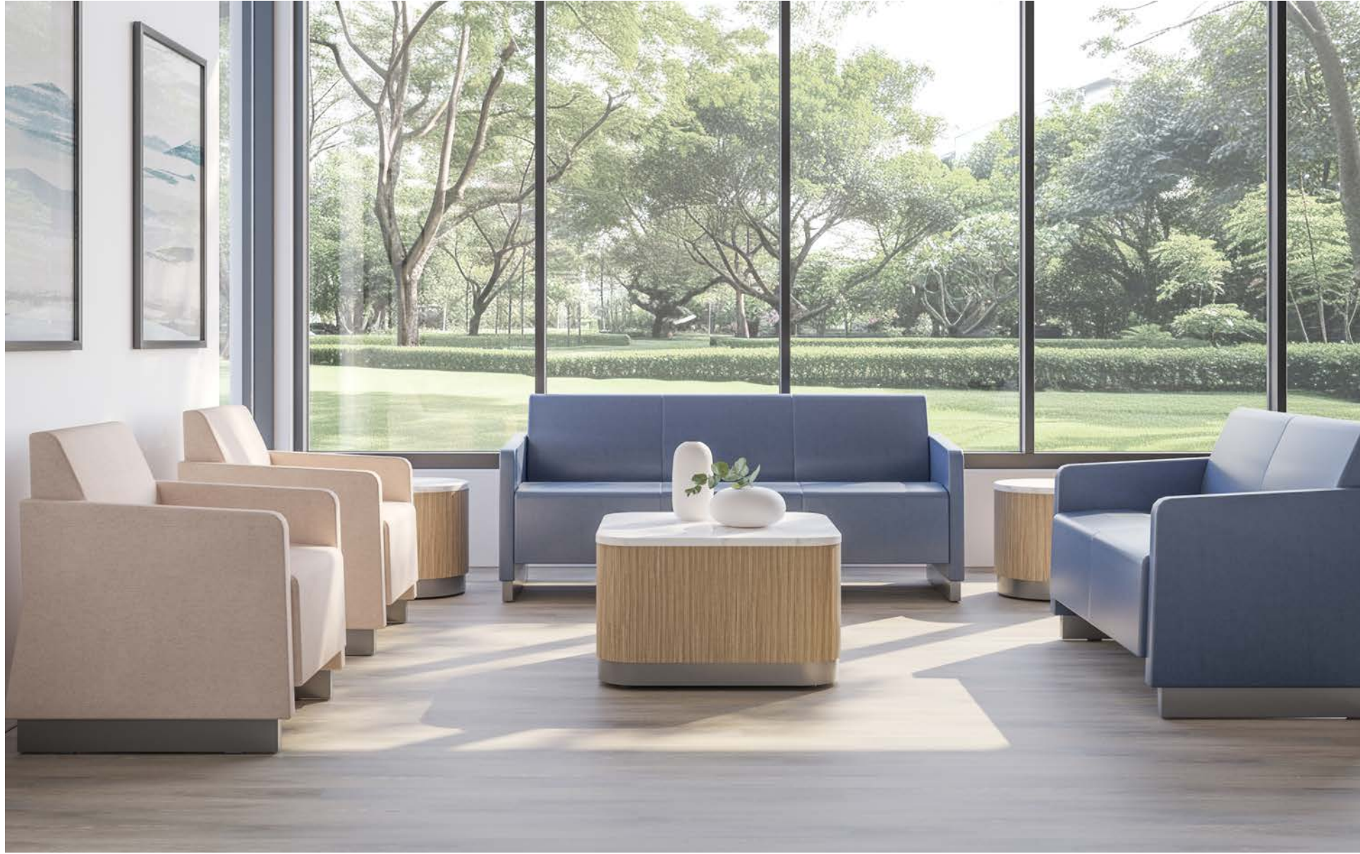
Faeron Lounge Behavioral Health