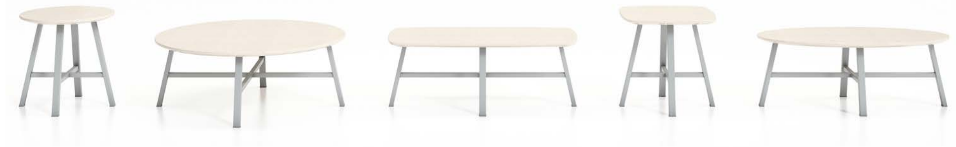
Faeron Metal Tables