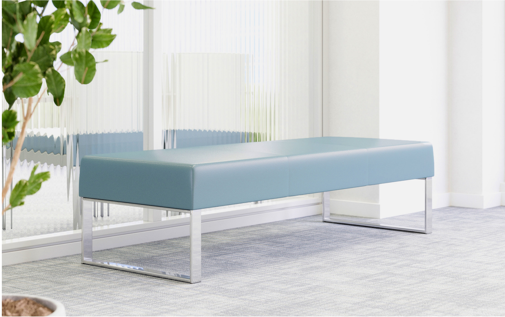
Tate Behavioral Health