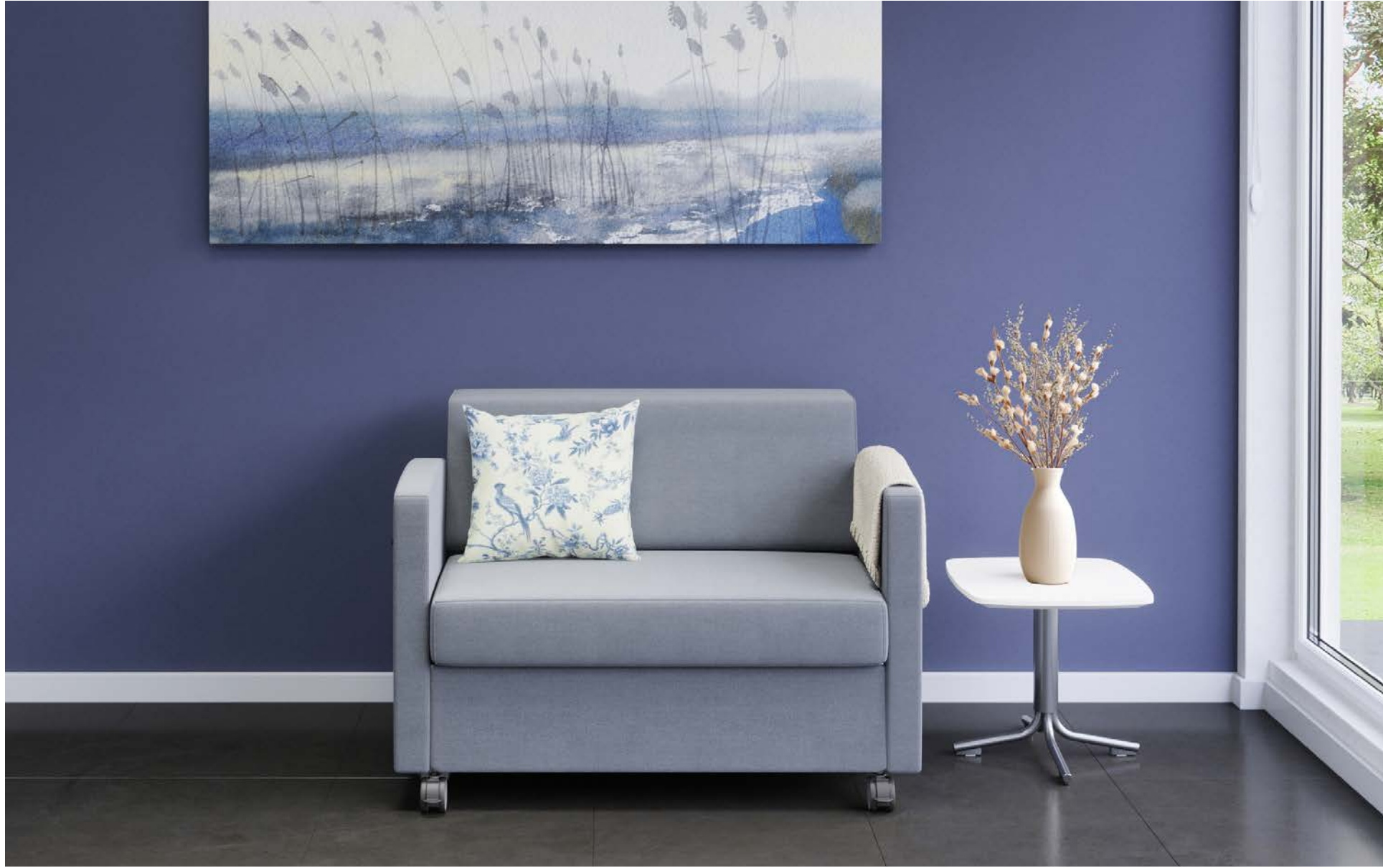
Jordan Side-Opening Sleeper