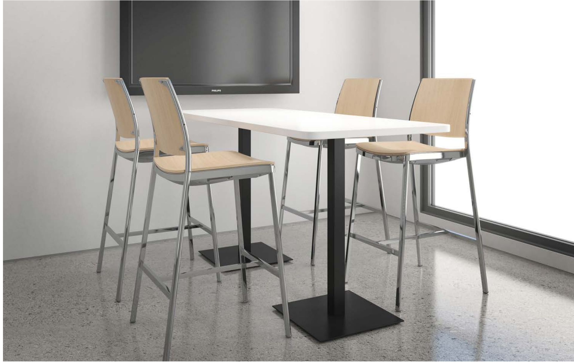
Chit Chat Conference