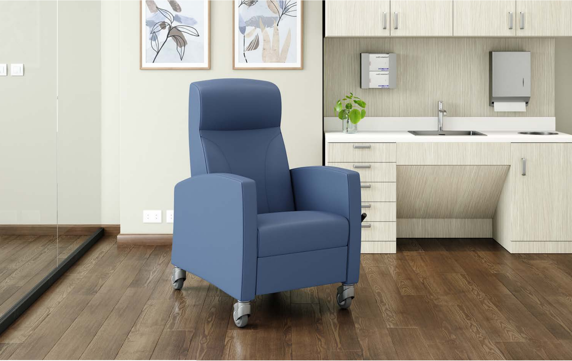
Jordan Compact Recliner