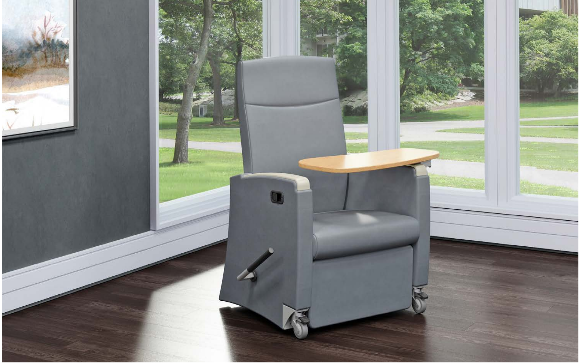
Jordan Active Patient Recliner