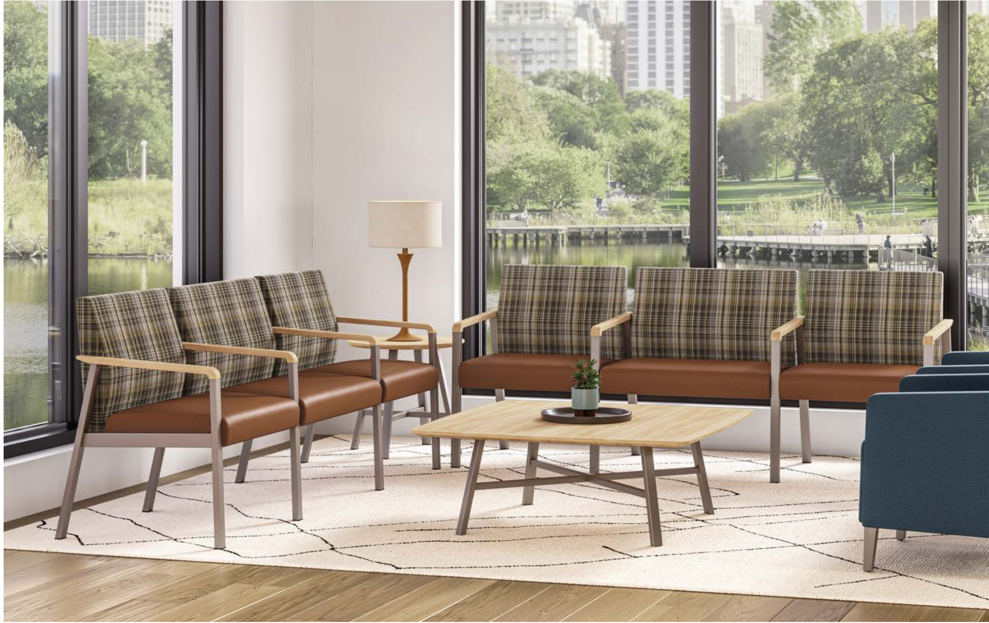
Faeron Metal Guest