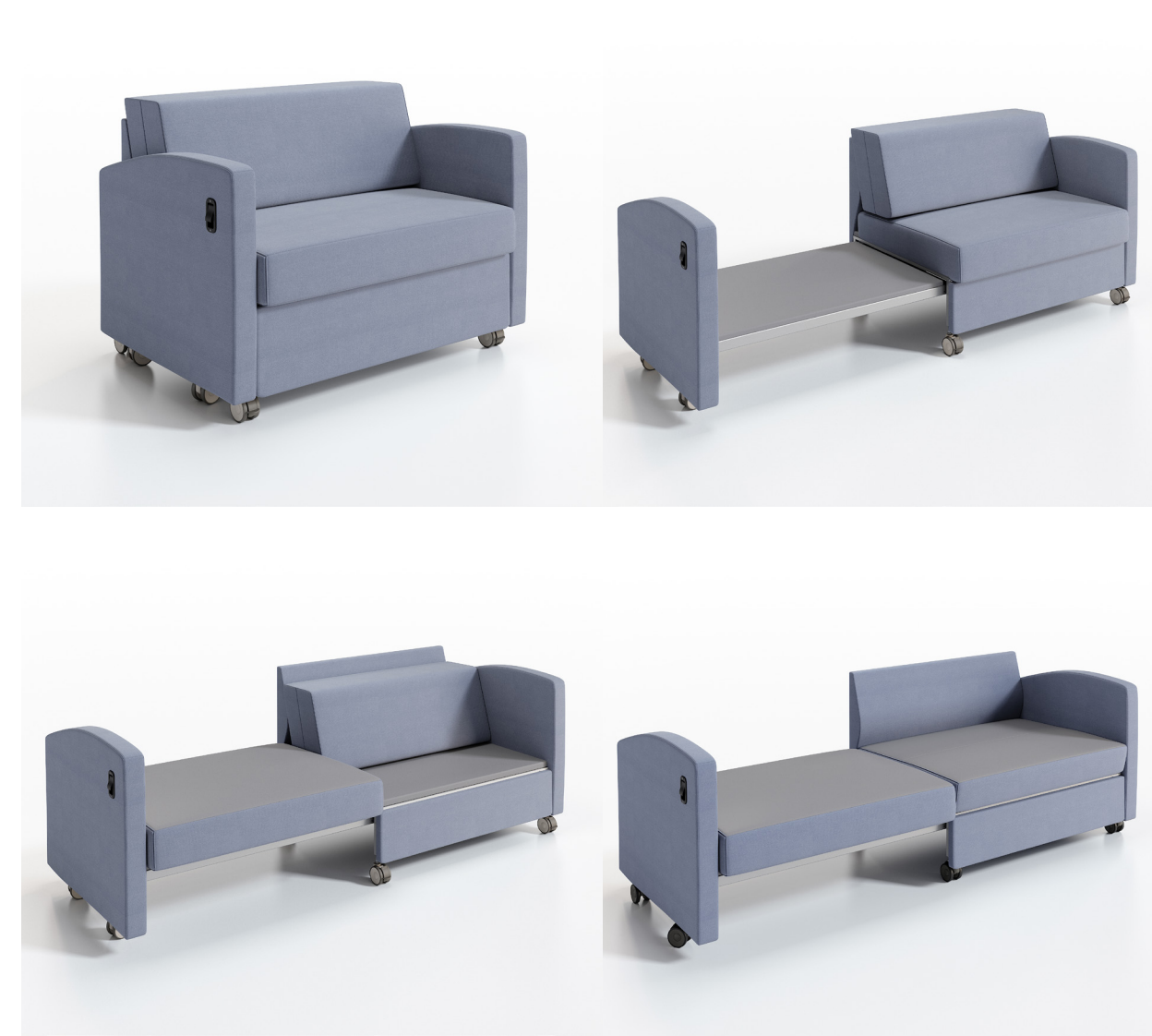
Extended Sleep Surface