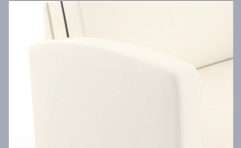
FULLY UPHOLSTERED ARM