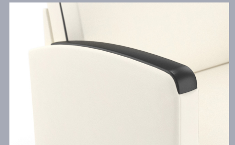
UPHOLSTERED ARM WITH URETHANE CAP