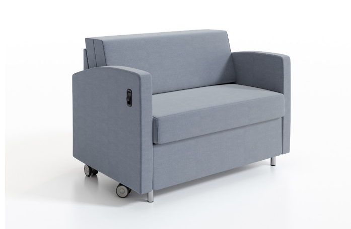
Upholstered Front with Legs

Combination upholstery option includes more than one upholstery cover within the same unit. Back, seat, and arm can be specified in a different fabric selection.