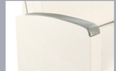
UPHOLSTERED ARM WITH SOLID SURFACE CAP