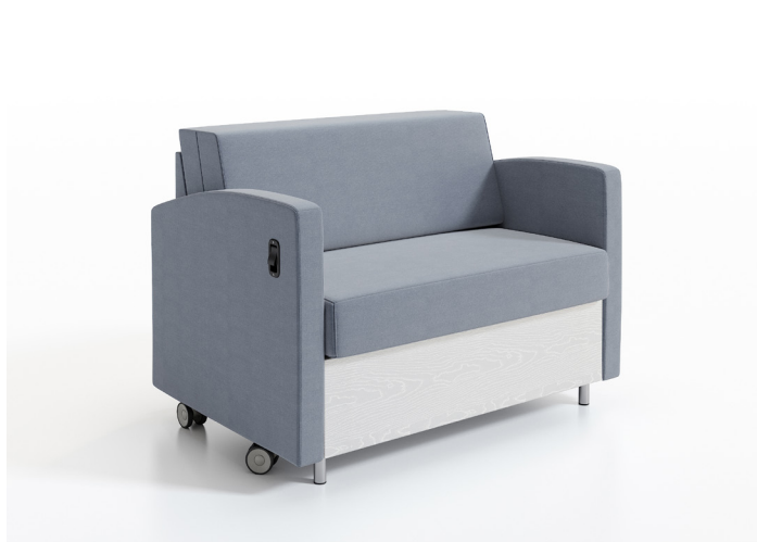
Laminate Front, with Legs

Allows for single action locking of all four casters at one time. Casters are locked both directionally and rotationally, keeping the recliner in place when locked. Central locking casters are 4" diameter with soft wheel treads.