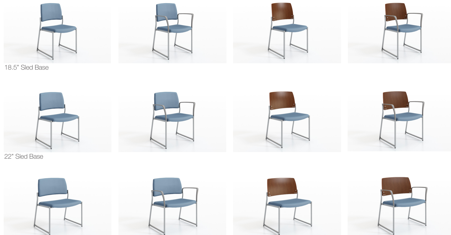
26" Sled Base

additional holes and bushings to allow for weight on the bottom of the seat adding 23lbs to each chair. When chairs are weighted they cannot be ganged.