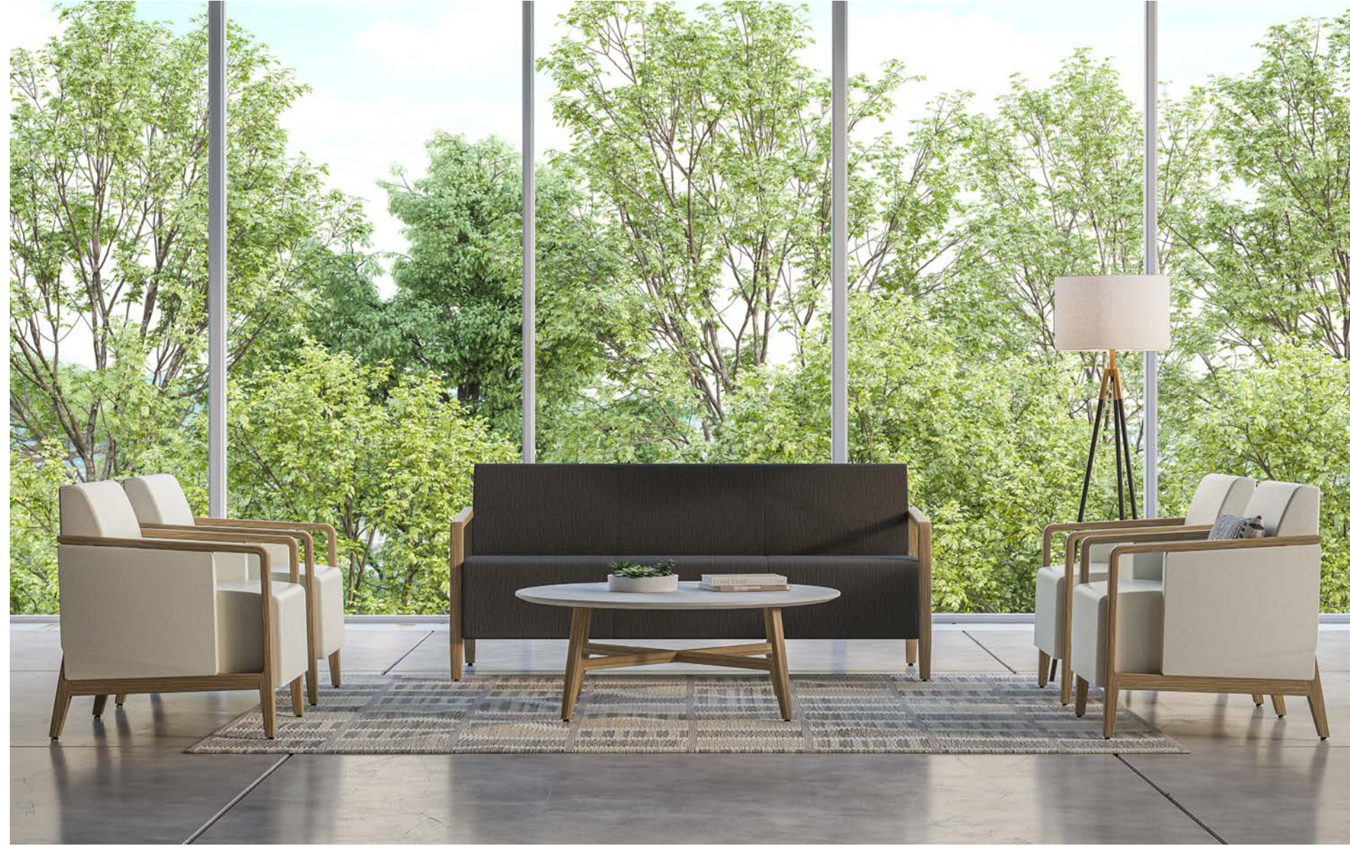
Faeron Wood Lounge