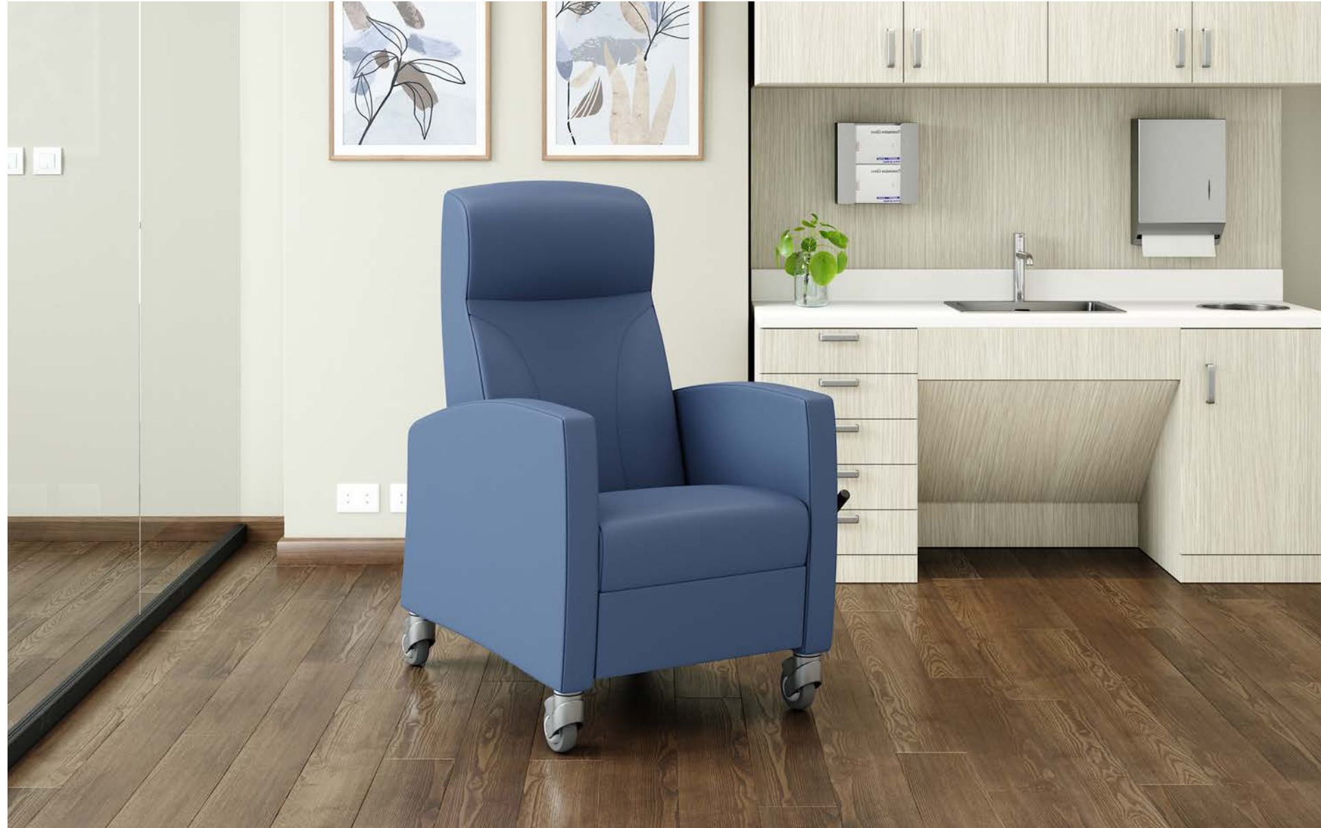
Jordan Compact Recliner