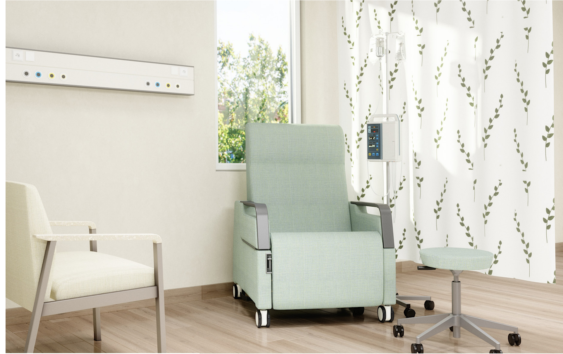
Ascend Exam Recliner