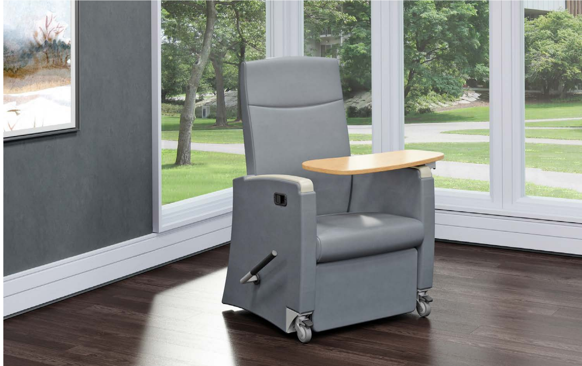
Jordan Active Patient Recliner