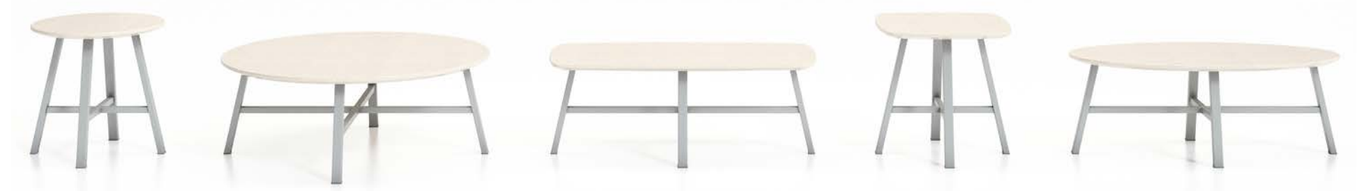
Faeron Metal Tables