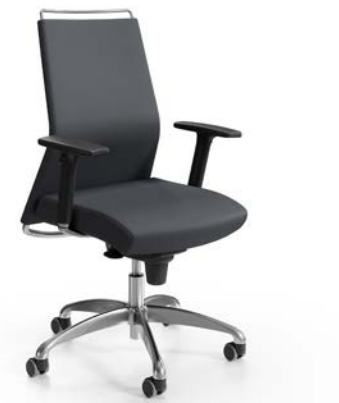
Dorso S & N