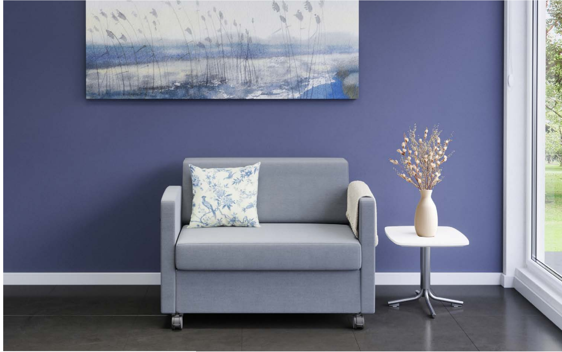
Jordan Side-Opening Sleeper