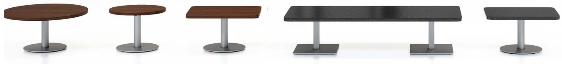
Chit Chat Tables