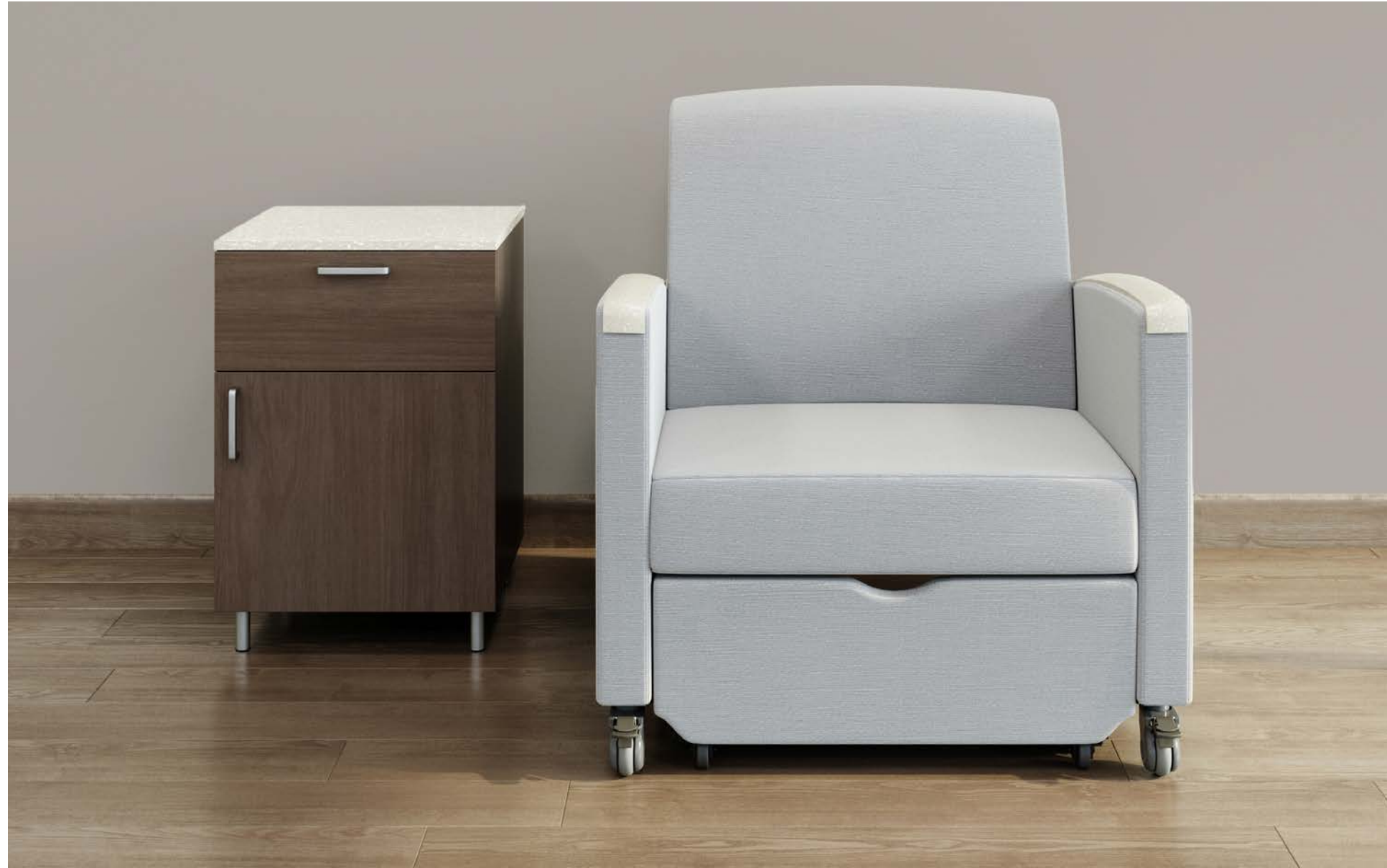
Jordan Lounge Sleeper