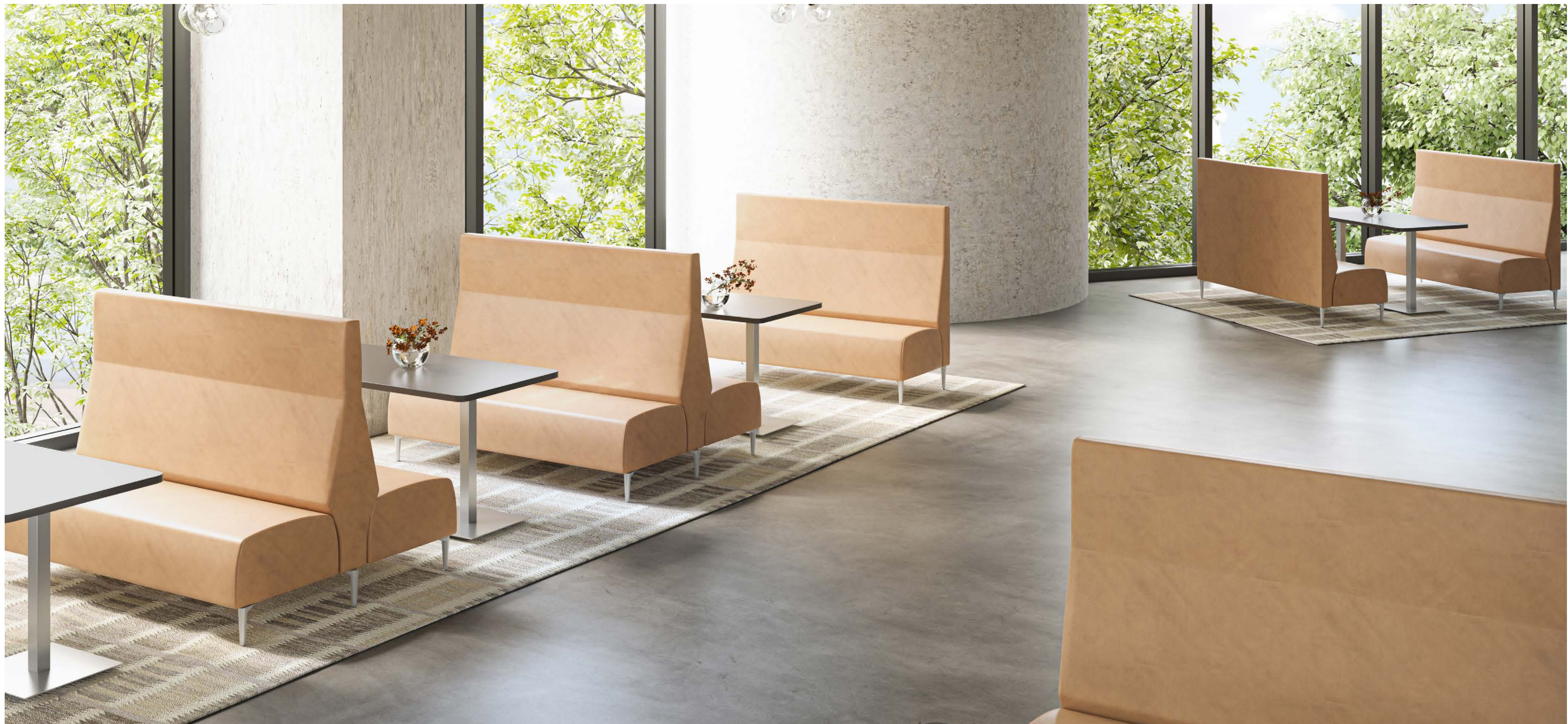
Zola Privacy featuring twin backs