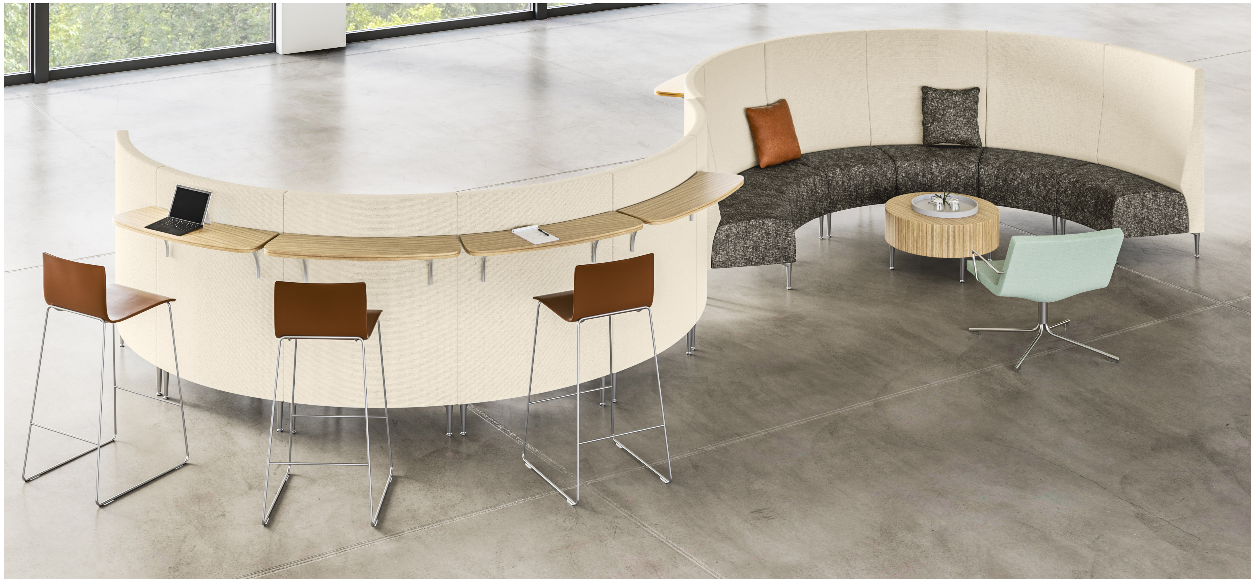
Zola Privacy curved with shelf option