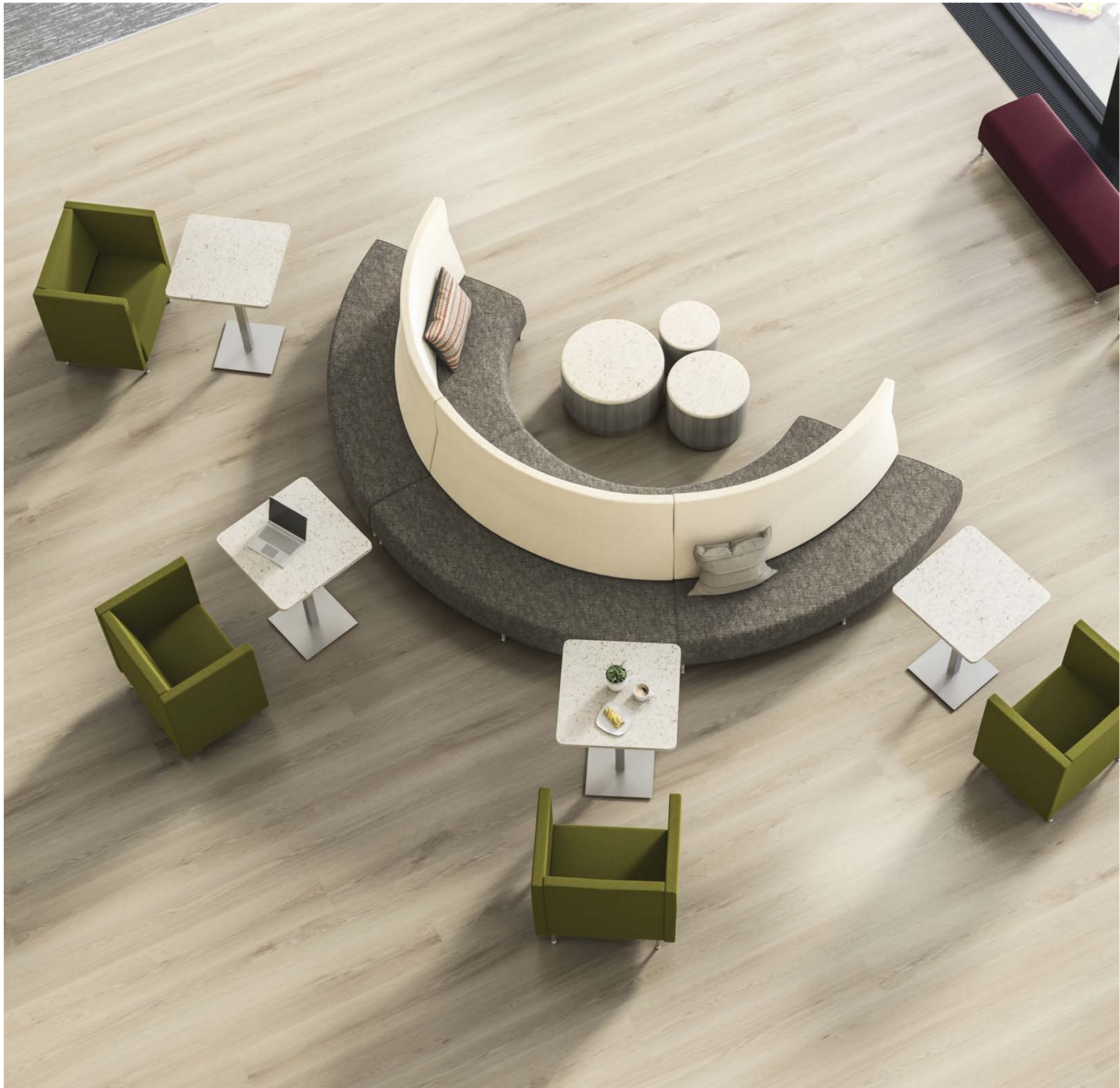
Zola Privacy curved, with Preconfigured lounge & Chit Chat tables