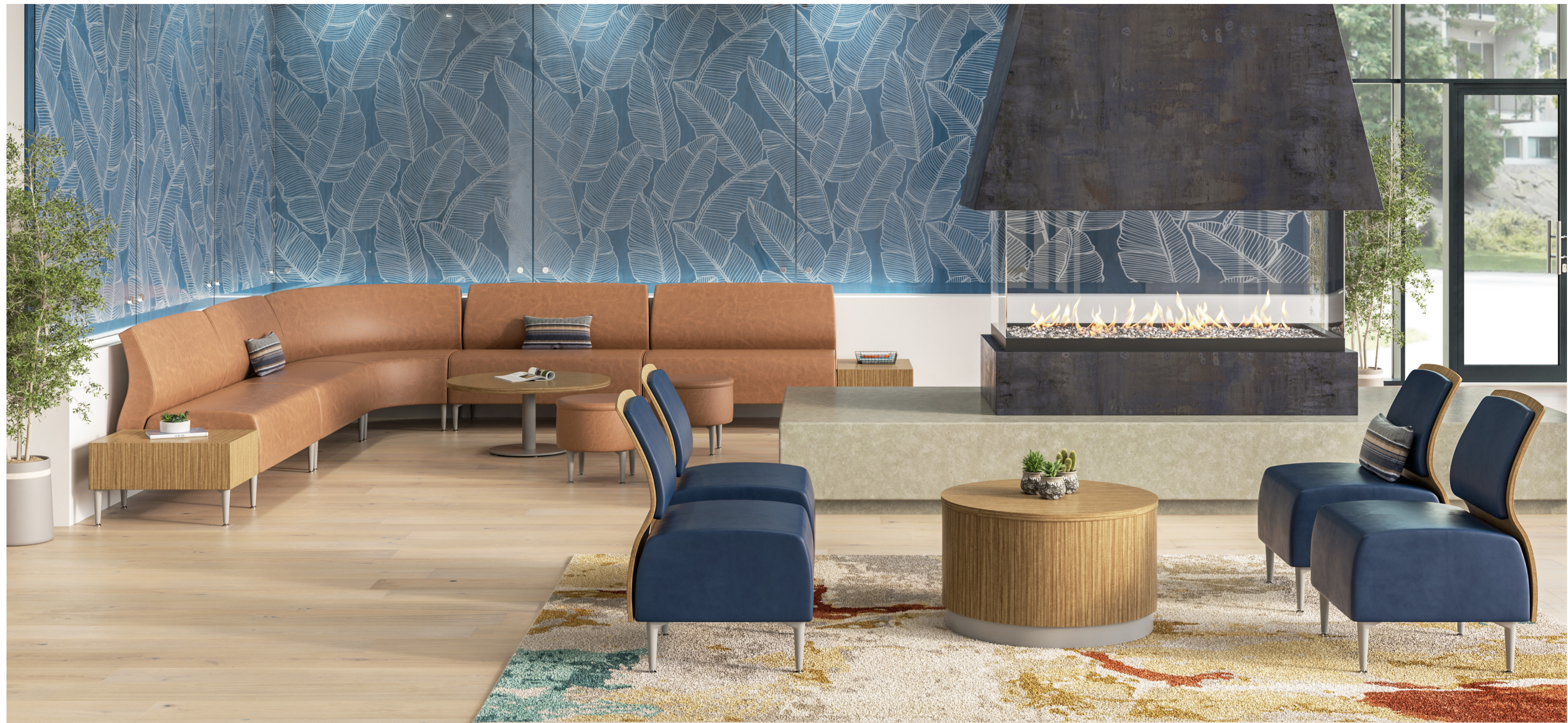
Zola Modular Lounge & Tables with Chit Chat Table