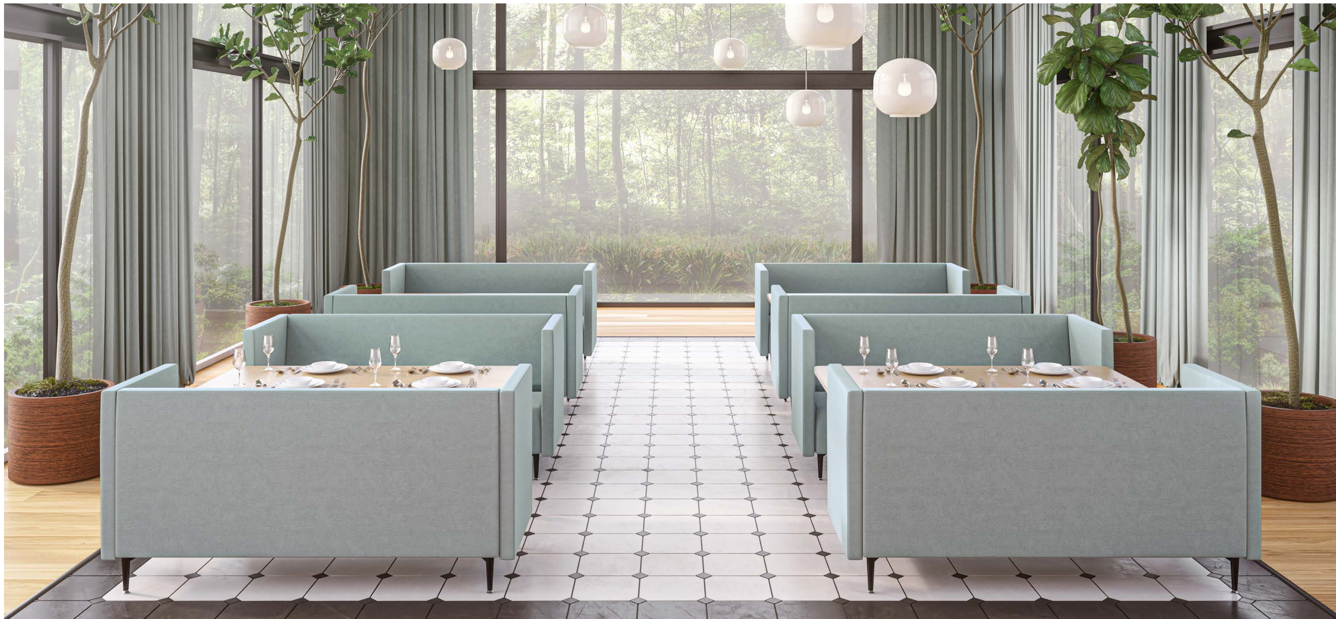
Zola Privacy featuring upholstered arms