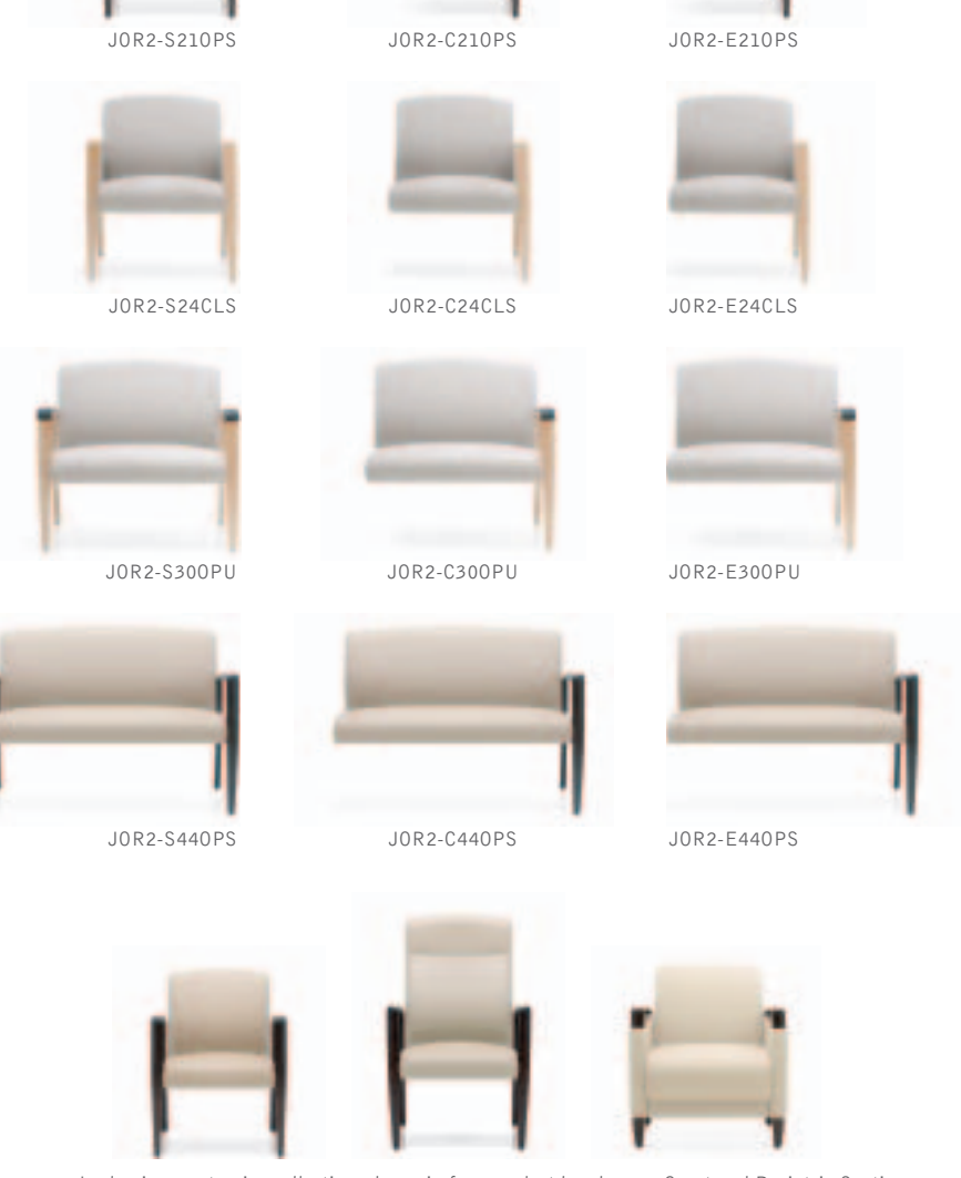
Jordan is an extensive collection, shown in four product brochures: Guest and Bariatric Seating, Patient Seating, Lounge Seating, and Multiple Seating and Tables.