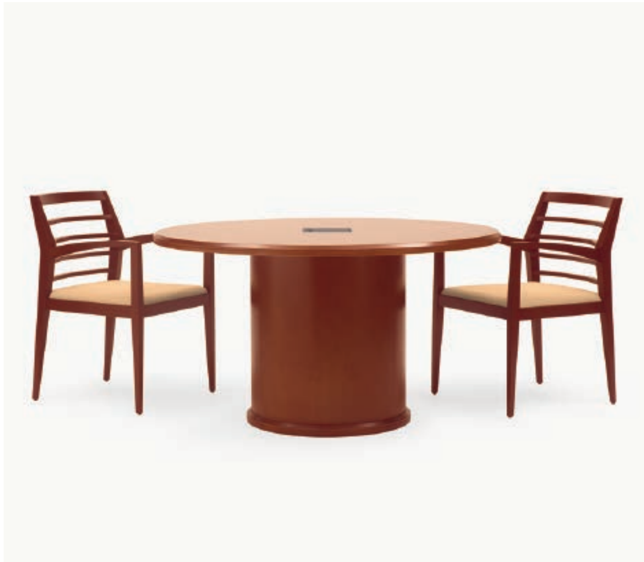
Small round meeting table with drum base

Endless laminate options and a variety of base configurations means truly adaptable solutions for boardrooms, libraries, meeting rooms and even the private office.