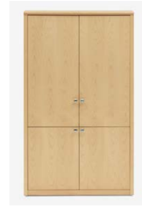
AV cabinet with upper pocket doors