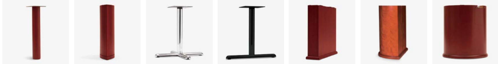
Round wood leg Elliptical wood panel base 4 prong metal base 2 prong black base Wood panel base Half round drum base Round wood drum base