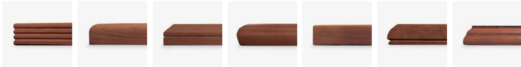
Madrid Barcelona Valen Zamora Torrens Seville Williamsburg