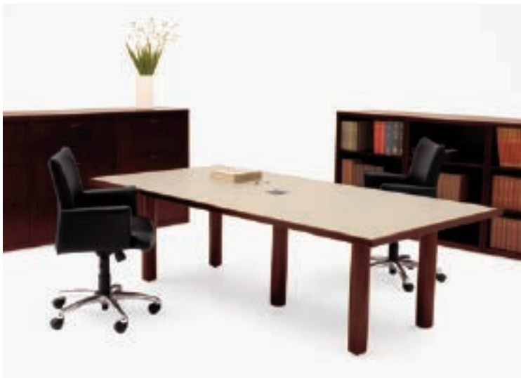
Rectangular top with wood post legs