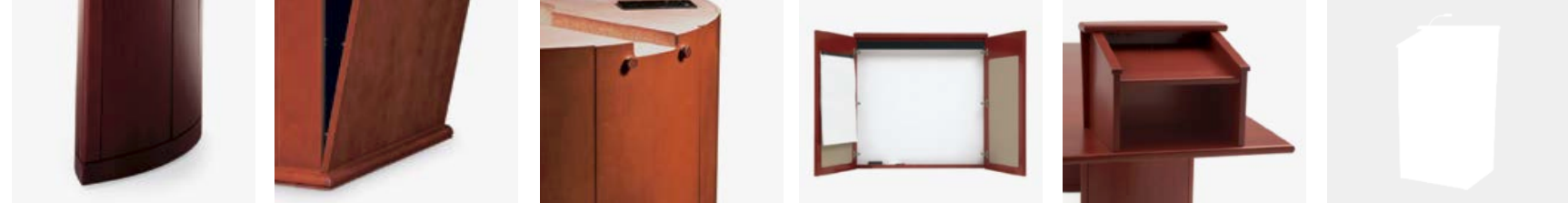
Wire access on elliptical base Wire access on panel base Wire access on round drum base Visual board Table top lectern Stand alone lectern