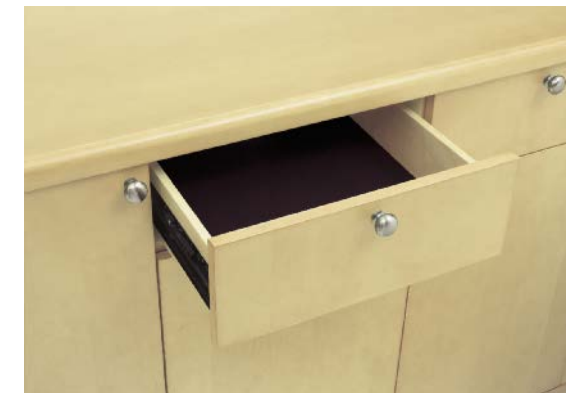
Felt-lined cutlery drawer in buffet