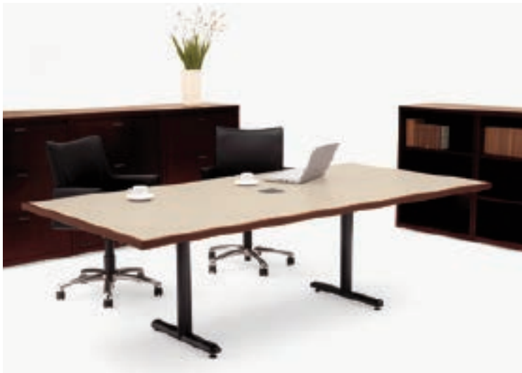
Rectangular top with metal bases