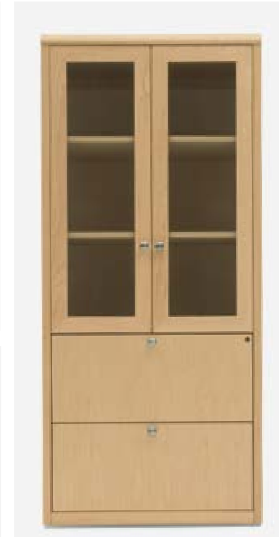
Storage unit with glass doors

From the Boardroom to smaller meeting rooms, Millennium offers you flexibility. Seven different edge profiles and 53 standard sizes combine to create unlimited design options.