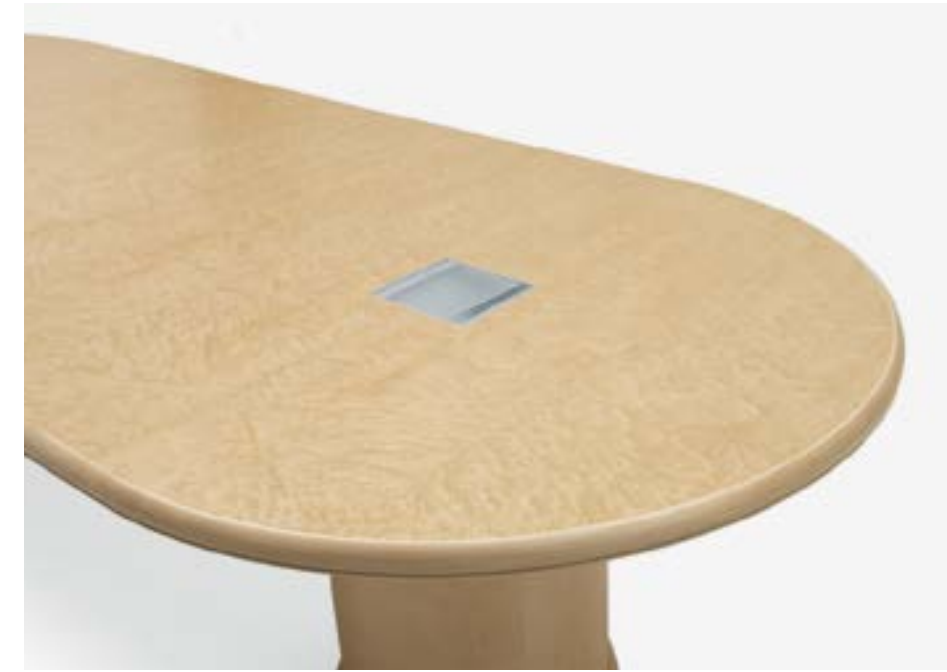
Racetrack top in birdseye maple with Connexus™ unit