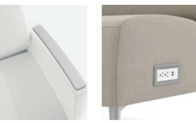
CLEAN OUT & ARM CAP OPTION