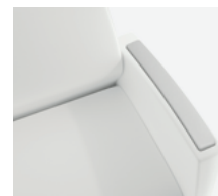
Optional Tablets are available on Zola Modular in veneer, glass, plastic laminate and Palette solid color finishes. CLEAN OUT & ARM CAP OF HON A clean-out space between the seat and back makes for easier cleaning and maintenance. An optional urethane arm cap provides durability and assists with infection control. The flush-mounted PowerDoc provides dual power/USB outlets for multiple devices. It can be located on either side of the seat, seat front, as well as on the front face of tables as standard.