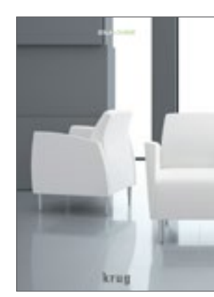
See also the complementing designs of the Zola Lounge brochure.