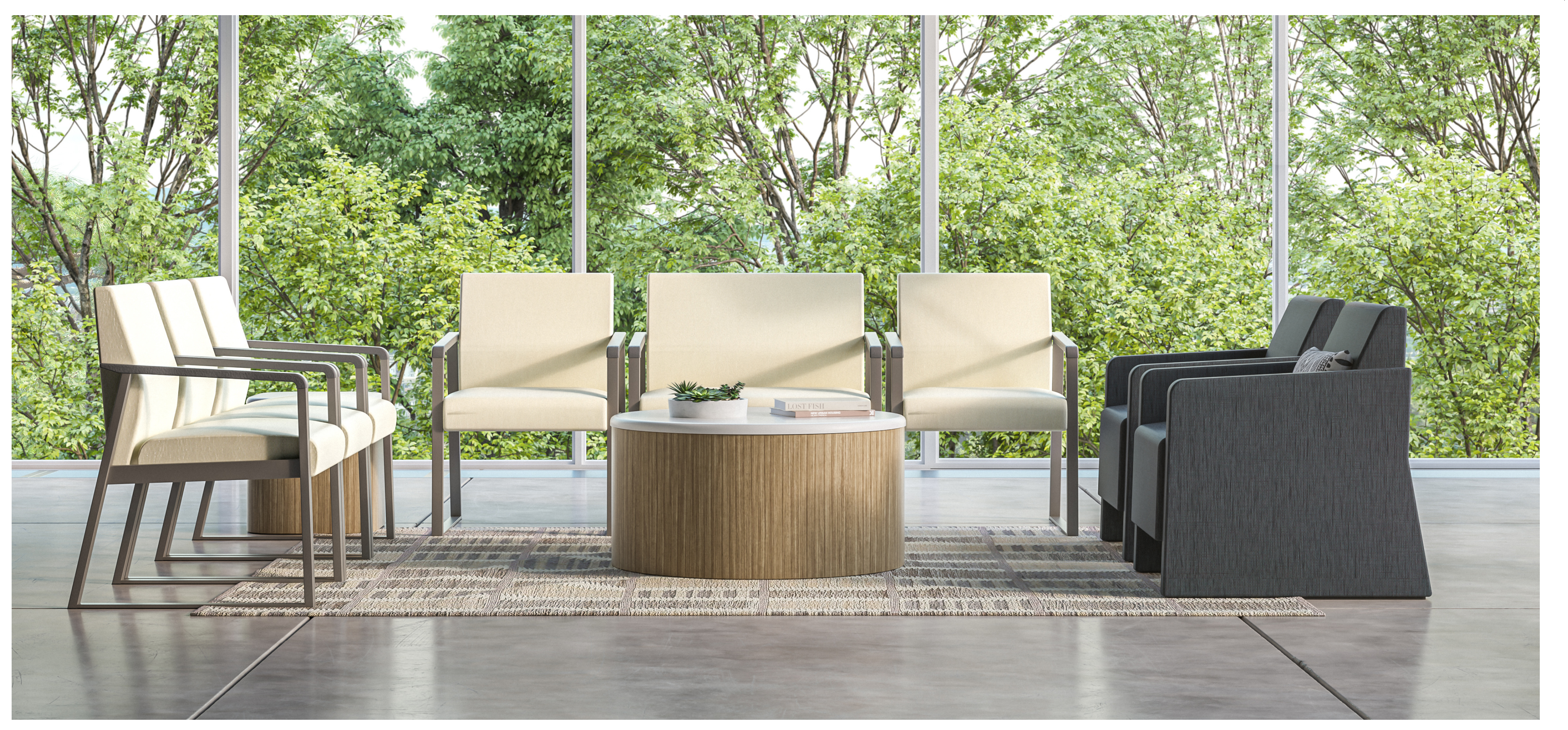
Faeron & Zola Behavioral Health