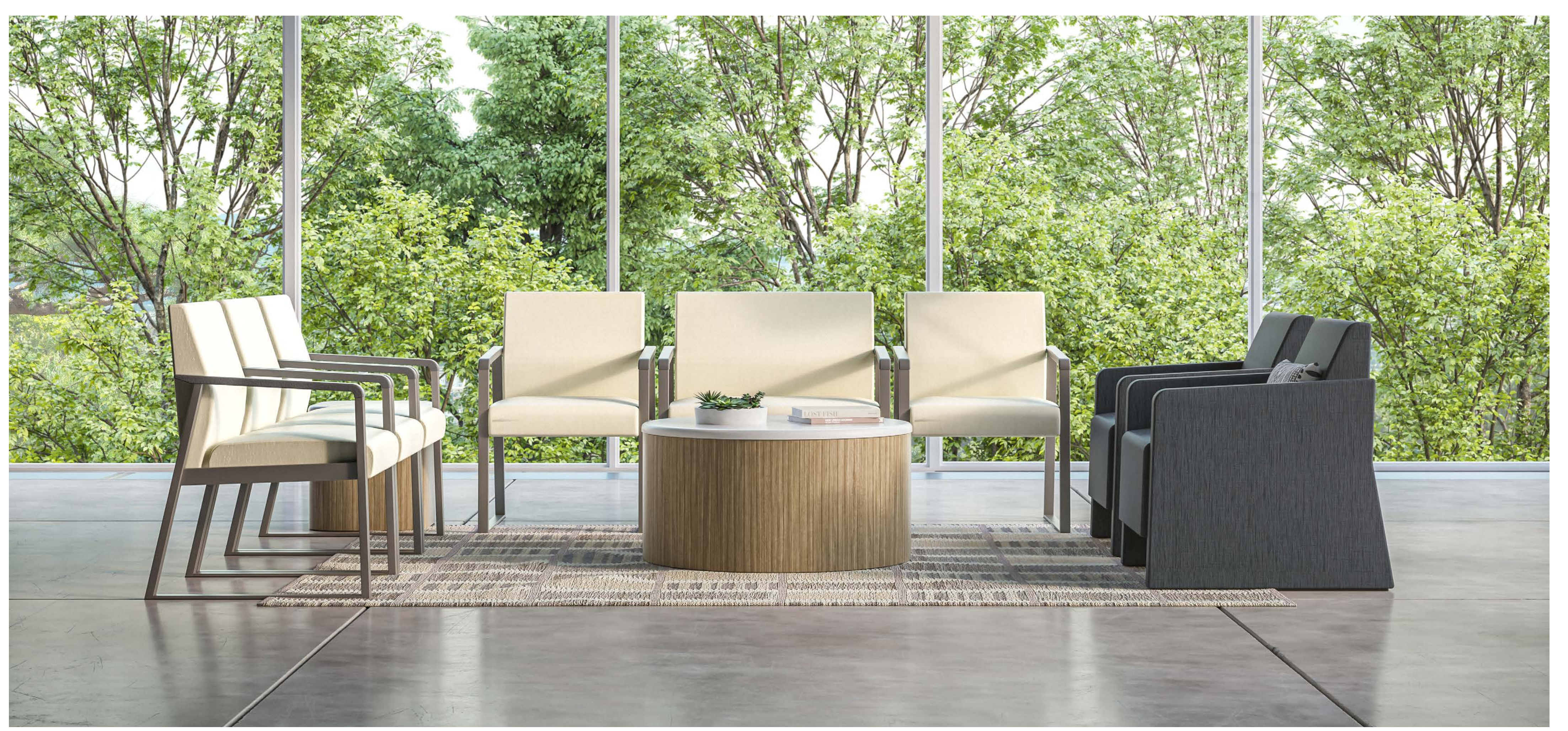
Faeron & Zola Behavioral Health