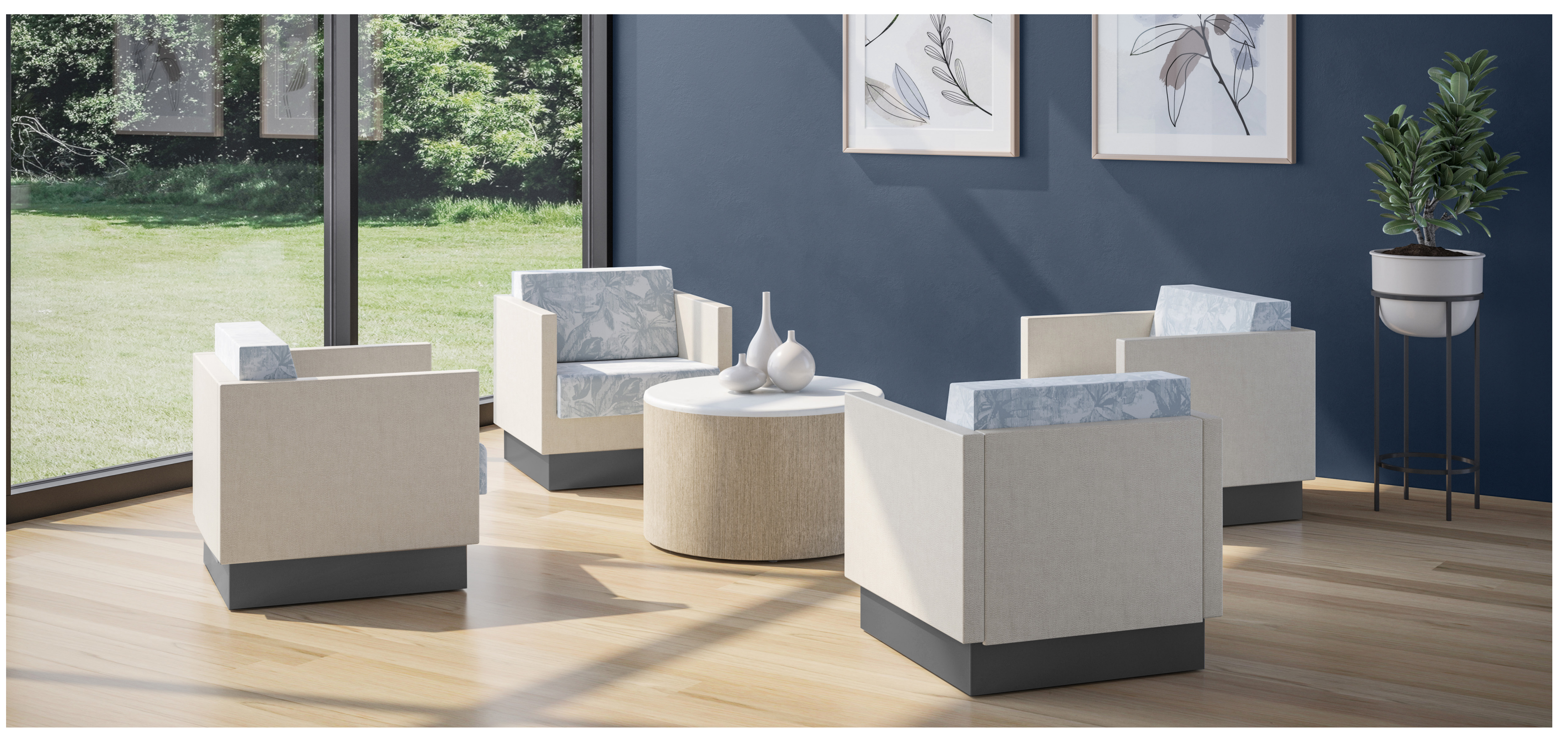
Leyton featuring Polymer Plinth Base