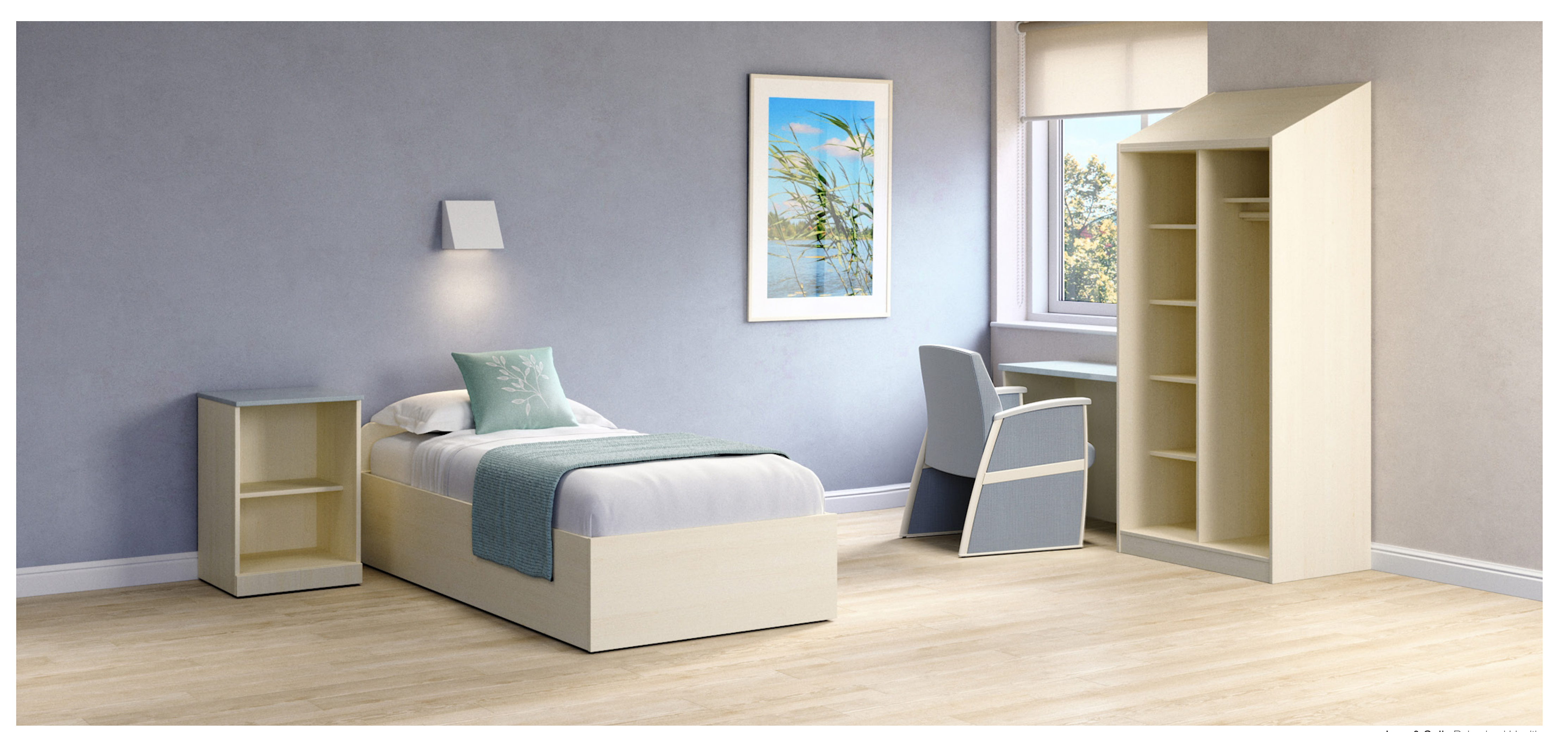
Juno & Solis Behavioral Health