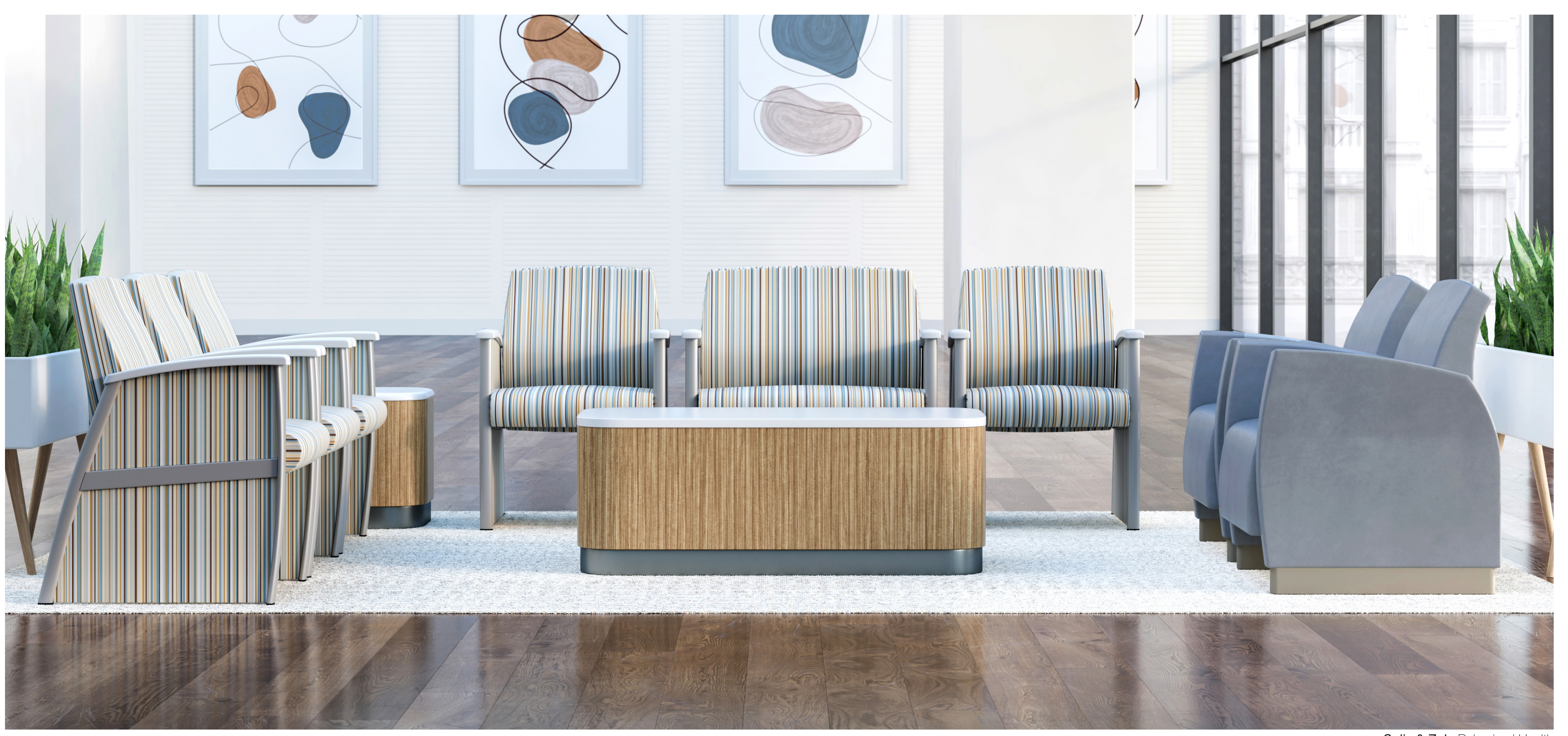
Solis & Zola Behavioral Health