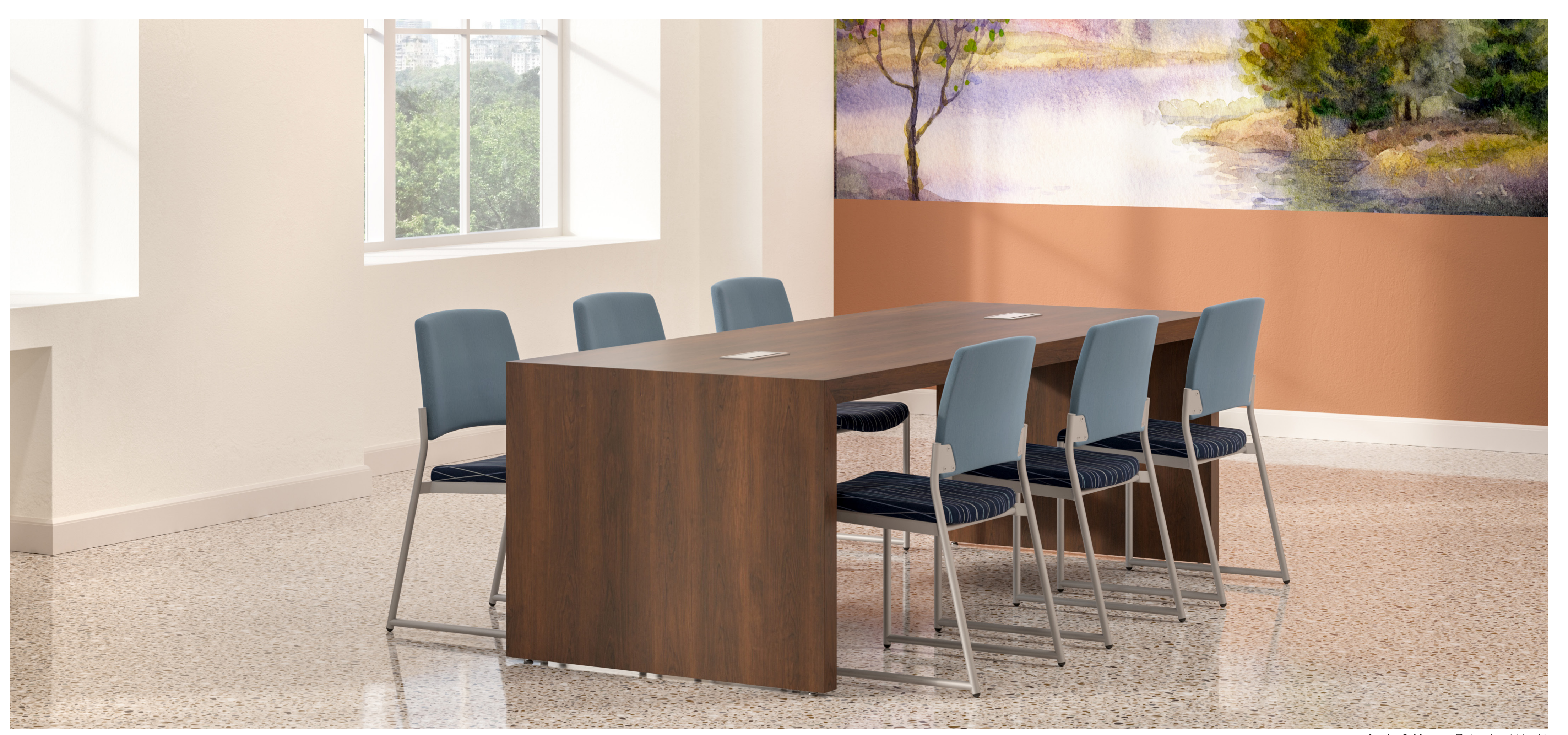
Ando & Karma Behavioral Health